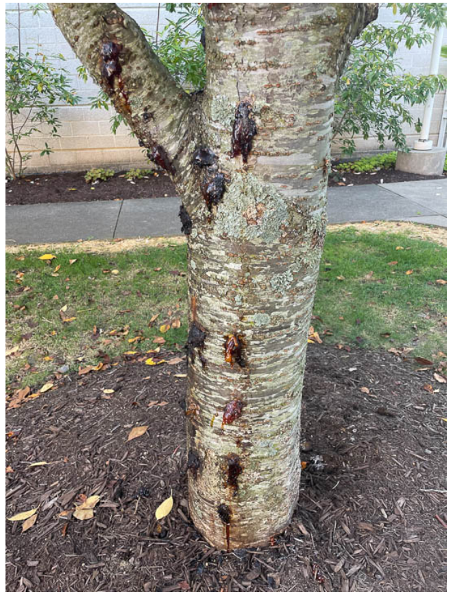
The sap oozing from the trunk of this ornamental cherry is the result of a peachtree borer infestation.