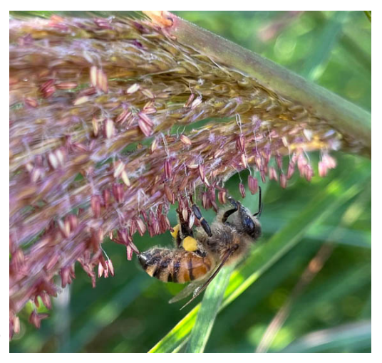
Grasses are a source of pollen for bees.

Marty Adams, Bartlett Tree Experts, found this honey bee visiting grass flowers for pollen. Even though grasses are wind-pollinated, they provide a source of food for pollinating insects.