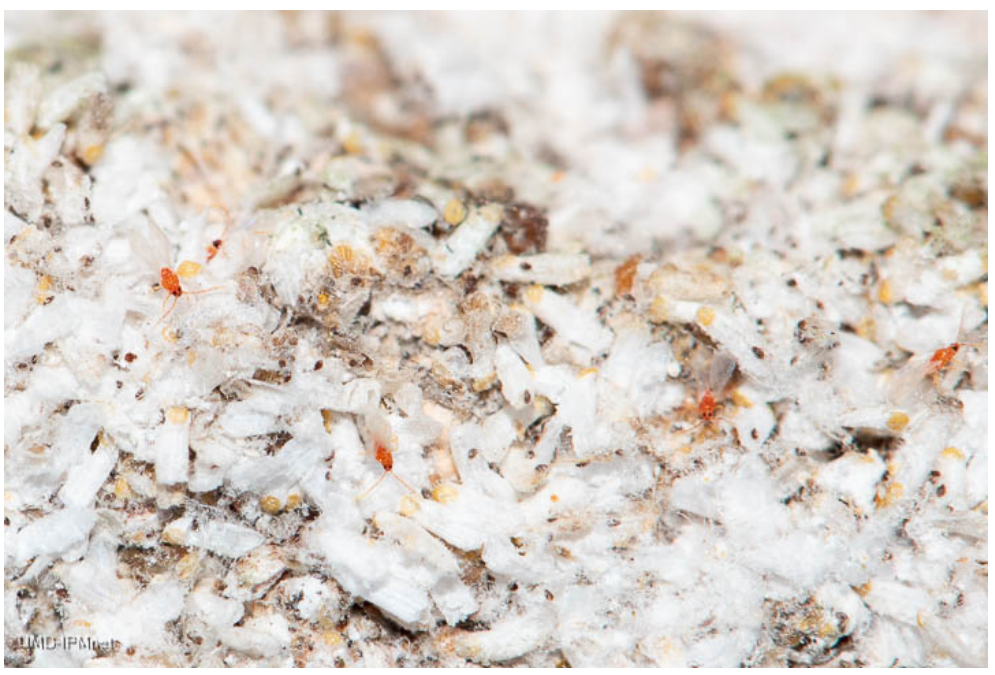
Many orange-bodied, winged adult males (adult females are wingless) of white peach scale were active on this peach tree sample.

We received a peach branch sample from the Eastern Shore of Maryland early this week. The sample was covered in white peach scale. There were many adult males present, so they are now mating with females. Gravid females will overwinter. It is the third generation.