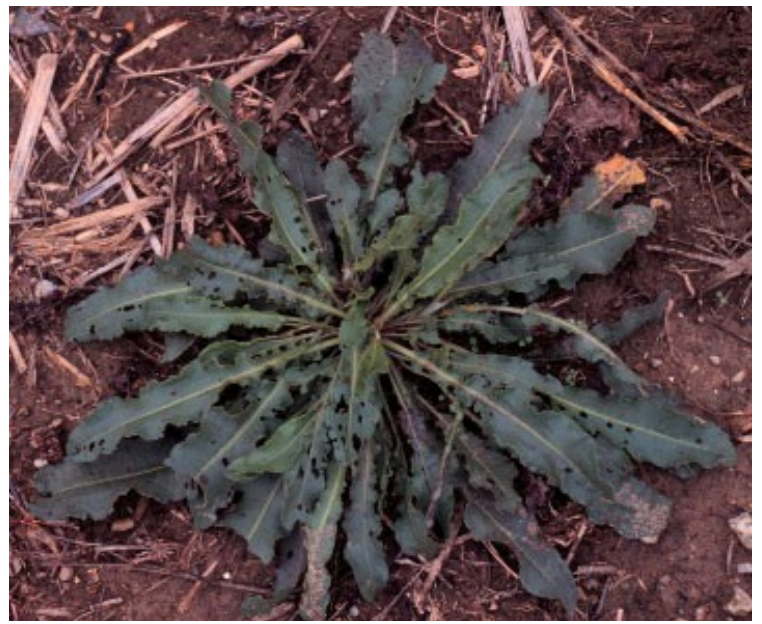
Curly dock rosette

Curly dock can be identified through a dichotomous key as a dicot broadleaf species with a basal rosette. Its leaves and stem are unarmed (without spines/ thorns) and simple with wavy but entire margins. It does not grow in a mat-forming habit and is also not vine like. Elongating flowering stems are smooth, ridged, branched toward the top with enlarged nodes and alternating leaves. Small greenish flowers are found in clusters at the top of the main stem, which produce flattened brown seedpods. Broadleaf dock can be identified in the same manner, but it is differentiated from curly dock because its leaves have