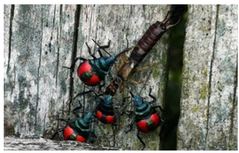
Nymphs, likely 3rd or 4th instar, of Florida predatory stink bug, Euthyrhynchus floridanus, feeding as a group on an earwig.

Euthyrhynchus is a predatory stink bug that is known to feed on a diverse range of soft-bodied prey items such as caterpillars, beetle larvae and adults, plant hoppers, other stink bugs (see image), earwigs (see image), crickets, dragonflies and more. Many of which are pest insects in our ornamental systems. Euthyrhynchus are often found foraging on the bark of trees and have a strong tendency to aggregate. Aggregations of Euthyrhynchus, especially early nymphal stages, may feed together on larger insect prey. They are considered beneficial stink bugs because many of the prey they attack are pests in ornamental and other plant systems. Although Euthyrhynchus alone does not likely make a huge impact on the biological control of pest insects, they are one of many generalist natural enemies that, as a complex, can provide an impactful biological control service of pest insects.