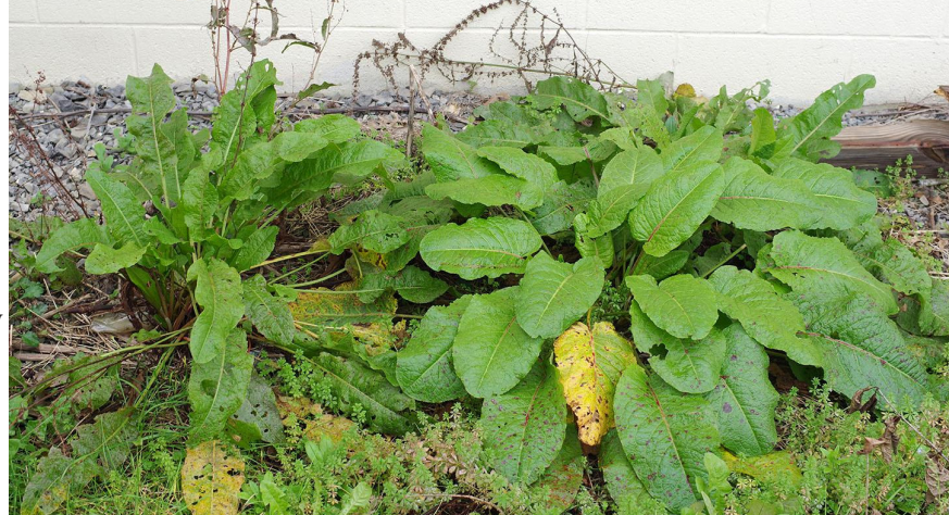
Large foliage of curly dock.

*Do not spray herbicides containing dicamba over the root zone of trees and shrubs. Roots can absorb the product