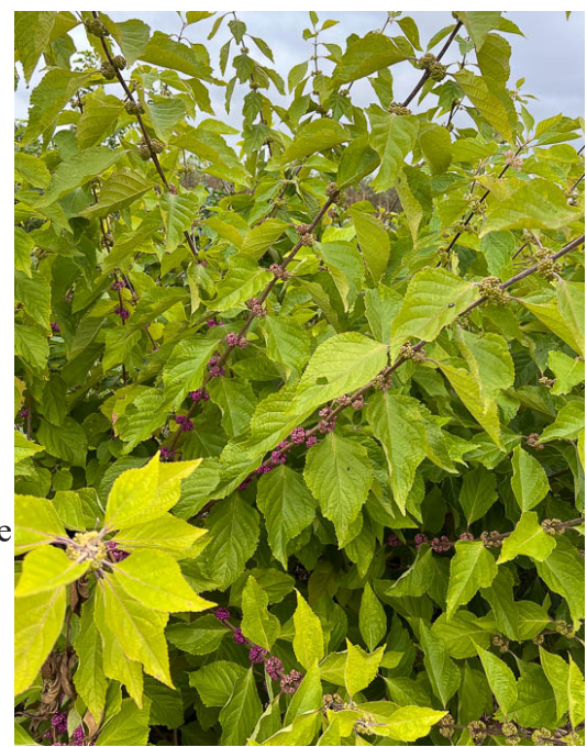
American beautyberry with fruit starting to show color.

In the Maryland area, the accumulated growing degree days ( DD ) this week range from about 2974 DD (Martinsburg, WV) to 4410 DD (St. Mary's City). The <u>Pest Predictive Calendar</u> tells us when susceptible stages of pest insects are active based on their DD. Therefore, this week you should be monitoring for the following pests. The estimated start degree days of the targeted life stage are in parentheses.