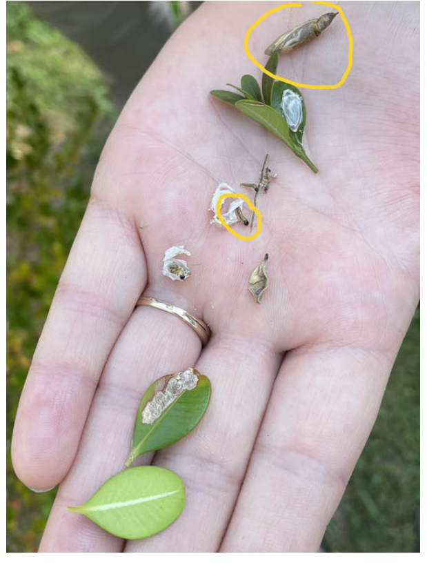
Boxtree moth larvae found in New York.

Nursery inspectors from the Central and Eastern Chapters of the Horticultural Inspection Society met up in Niagara County, New York in early October for a meeting. The main focus was the boxtree moth situation in New York. Field visits were made to local nurseries and a cemetery. This photo shows a caterpillar and pupa. Early trapping was the takeaway message. Please remember this pest is under federal quarantine and should be reported to the state regulatory authority.