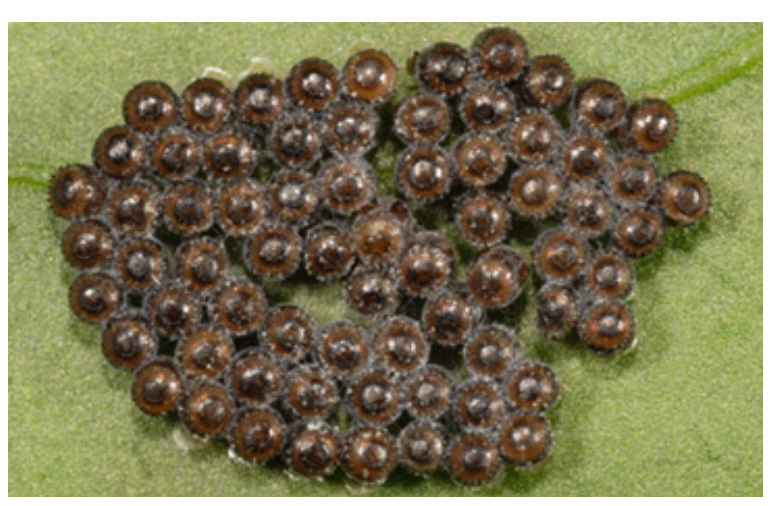
Egg mass of the Florida predatory stink bug, Euthyrhyn chus floridanus . Note the barrel shape with a circle of spines around the operculum (ring at the tip of the "barrel").

Adult Euthyryhnchus have the typical stink bug or shield shape to their bodies and are about 12-17 mm