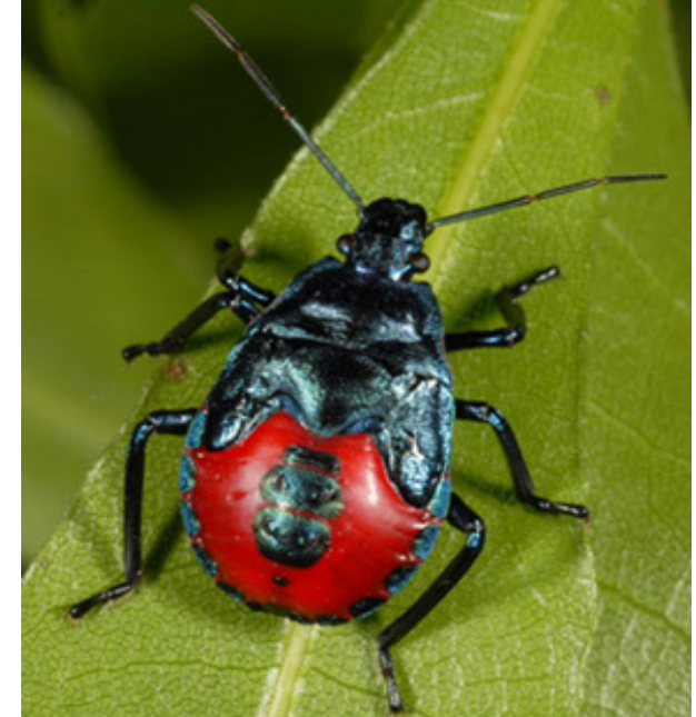
A fifth instar nymph (last immature stage) of the Florida predatory stink bug, Euthyrhynchus floridanus. Note the characteristic black wing buds (not fully developed wings).