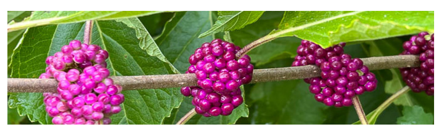
American beautyberry with brightly colored fruit.

berries) and partial shade. They like to grow in organic, evenly moist, well drained soils, and once established are tolerant of some drought. The arching branches grow in an open growth habit with their serrated margined leaves arranged in an opposite fashion. The leaves produce a chemical that can repel fire ants, mosquitoes, and ticks when crushed. In late winter, the old canes or branches can be removed at the ground to encourage new growth, because that is where the flowers and berries grow. The leaves will drop in the autumn to show off the bright beautiful berries, and are excellent for cutting. American beautyberry is cold hardy in USDA zones 6-12, but do better in the warmer areas that include the tropical islands of Bahamas, Bermuda, Cuba and other Western Indies islands. Plants can be planted as a backdrop for shrub borders, massed plantings, naturalized areas, butterfly, pollinator, native and winter gardens. There are no serious pests.