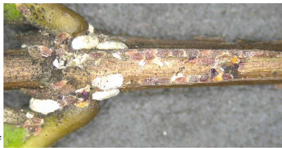
There was a high population of crapemyrtle bark scale when monitored on October 4.

We have a group of small crape myrtles at the research center which have severe infestations of crapemyrtle bark scale. We are monitoring to determine their life cycle and crawler emergence in Maryland. This year in Ellicott City, there was a large peak in mid-June at about 645 DD and a few smaller peaks after that time. Crawlers are very small and pink, and they tend to settle in small crevices like underneath exfoliating bark or in the layers of seed heads after bloom. I also have not found them on newer tender growth except the seed pods, mostly older growth that has started