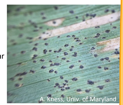
Figure 1. Magnified image of tar spot on corn leaf. Black spots are slightly raised on the upper surface of the leaf and cannot be wiped or scratched off.

Tar spot may appear in corn on any above-ground plant surface and may appear at any growth stage. P. maydis requires cooler temperatures and moisture to infect corn. Over the past few weeks we have had relatively cool daytime and nighttime temperatures, coupled with rain (leaf wetness). This combination of cool temperatures and wet plants could flare tar spot infections. I encourage you to scout your fields in the coming weeks to look for the raised, black lesions of tar spot (Figure 1). Research has indicated that fungicide applications around VT/R1 have the best odds of return on investment for managing tar spot; however, in some cases a second application made as late as R4 may also provide an economic benefit if weather conditions remain cool and wet .