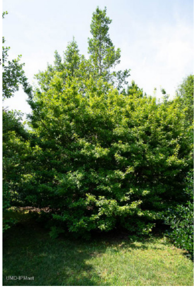
Ilex pedunculosa is considered deer resistant.