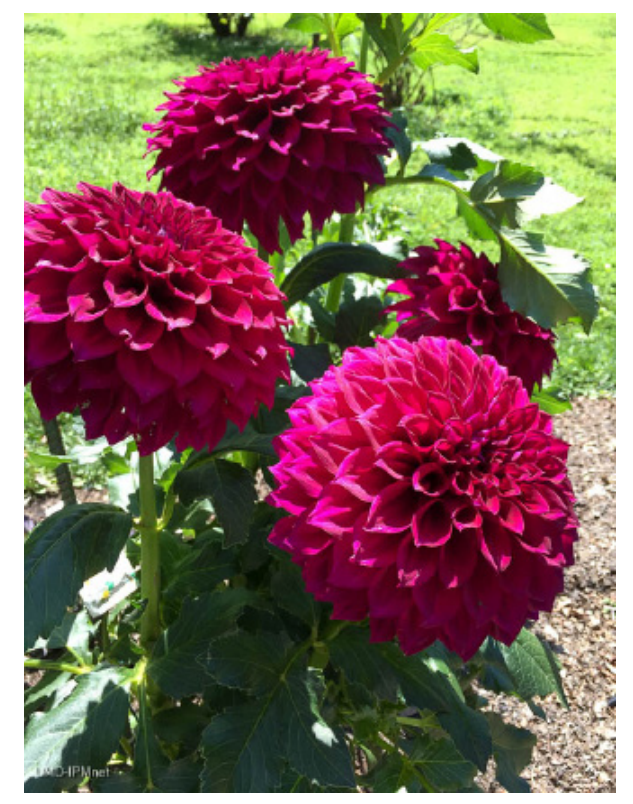
Dahlias in thrips control trial.