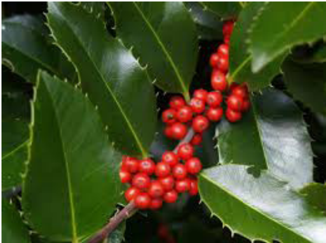
This Ilex x koehneana 'Wirt Winn' is a specimen tree growing in Sue's nursery. The only male pollinator for this holly is 'Ajax'.