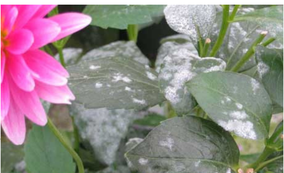
White growth of powdery mildew on dahlia leaves

White or light gray fungal growth on leaf surfaces is evidence of this fungal disease. Heavily infected leaves may turn brown. Powdery mildew on dahlia is caused by Golovinomyces cichoracearum (formerly Erysiphe cichoracearum), which has a large host range encompassing many members of the plant families Asteraceae, Cucurbitaceae, and Solanaceae. Powdery mildew is favored by moderate temperatures (60s to high 80's F), lower light levels (somewhat shaded locations or lower leaves), and high humidity. In contrast to other fungal diseases, leaf wetness is not required for powdery mildew infection – in fact,