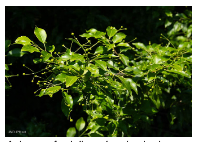
A close-up of early llex pedunculosa berries.

Another holly that Sue Hunter showed us is Ilex pedunculosa. This holly is commonly called longstalk holly. Its native range is Japan, China, Taiwan. We had ever seen such an unusual holly. The flower is on a long stalk and individual berries form on these stalks. The foliage is not spiny and it looks like this holly would be deciduous, dropping foliage in winter. Sue tells us it retains its foliage in fall, but it turns a maroon red color. The berries that are on the stalks turn bright red. She says they cut branches for use in holiday decorations, and it holds up for several months. Sue did sell us several, along with a male pollinator. For females to bear fruit,