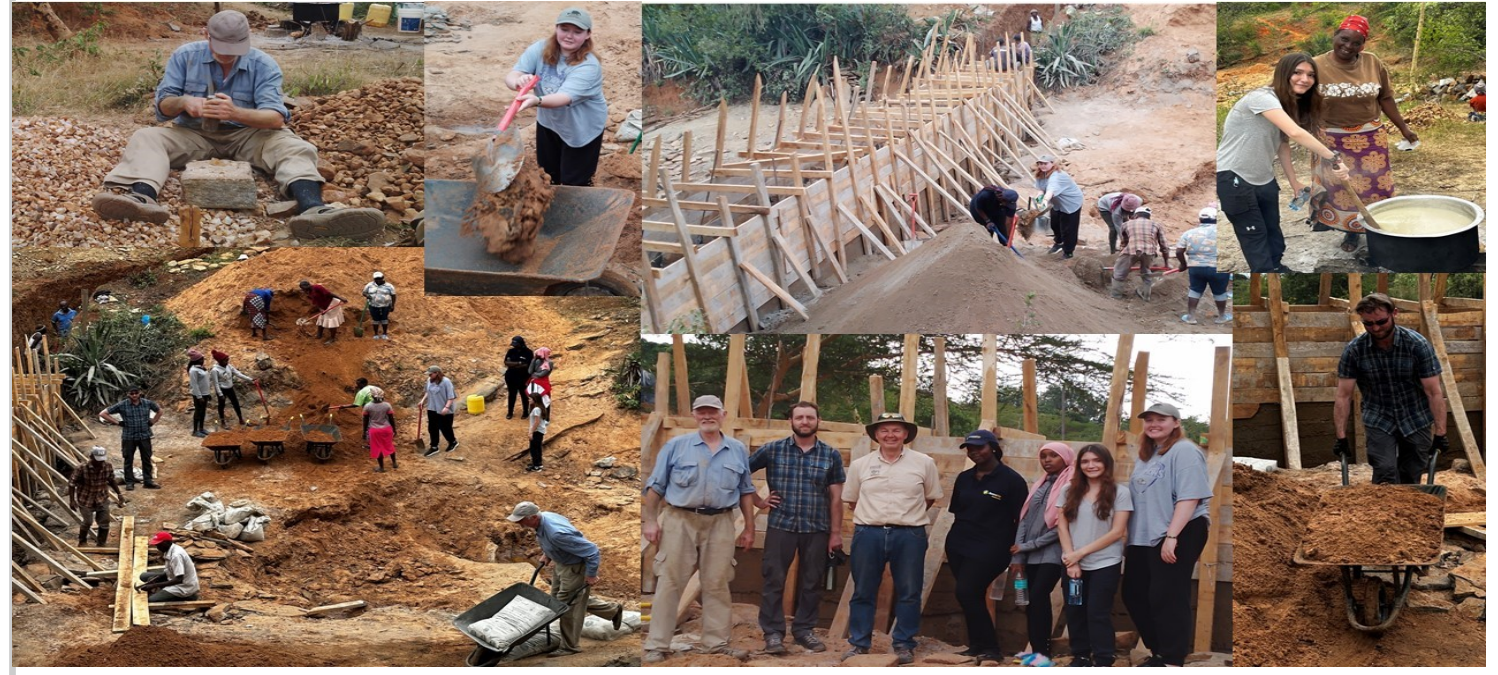
At the top of the Lukenya Plateau

Working together to build a dam to sequester seasonal rains so they no longer have to search each day for water.