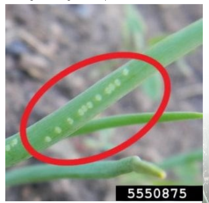
Figure 1. Onion leaf blade showing linear white dots made by female Allium leaf miners.

If you grow leeks or onions or other Allium species, you should already be checking for the tell-tale marks left by Allium leaf miner. Allium leaf miner, Phytomyza gymnostoma , tell-tale marks consist of many linear small white dots (made by the female's ovipositor) that appear in the middle towards the end of leaf blades (Fig. 1) of their preferred hosts of leeks, onions, garlic and other Allium species. Spring crops are usually not as hard hit as fall crops especially when looking at leeks, but this pest has been steadily increasing its geographical range each year as well as its damage potential. If you had some infestation last year you will especially want to be looking for the signs of this pest.