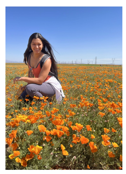
Amazing poppy super bloom in California( Monika's daughter in the picture)