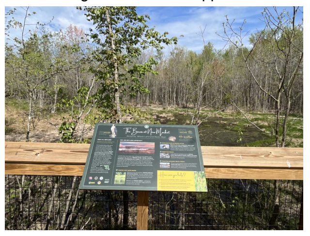
"New educational sign on wetland overlooking the wetland area at the Barns of New Market"

If you are in the Charlotte Hall area, be sure to stop in and check out the new Barns of New Market farmers market. The market was built by St. Mary's County government under the oversight of the Southern Maryland Resource, Conservation and Development Board as a new location for the overflowing market at the Charlotte Hall Library. The SM Master Gardeners and the Watershed