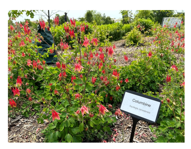
Columbine Aquilegia canadensis