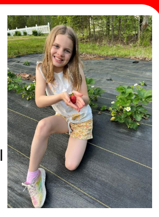
The very first strawberry of the season. April 21, 2023.

Hello St. Mary's County Master Gardener's and happy spring to everyone. This is one of my favorite times of year- a time of renewal, growth and green. The longer days and warmer temperatures beckon an inner earning to do—to plant, to cultivate, to be productive. At home, we are enjoying the short burst of color from our peonies. This year we tried our hand at growing annual strawberries. Annual strawberries are planted in early fall as plug plants, covered in the winter to prevent cold injury and then harvested in late spring. This was a good season for annual strawberries, and ours have been very productive. We are enjoying the sweet treat with homemade ice cream and fresh strawberry pies.