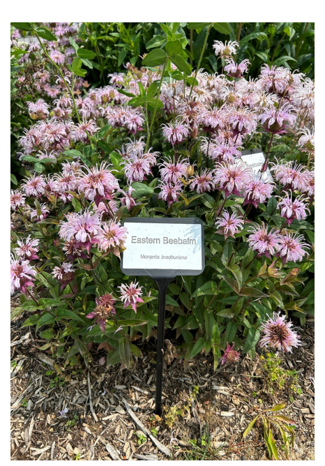
Eastern Beebalm Monarda bradburiana