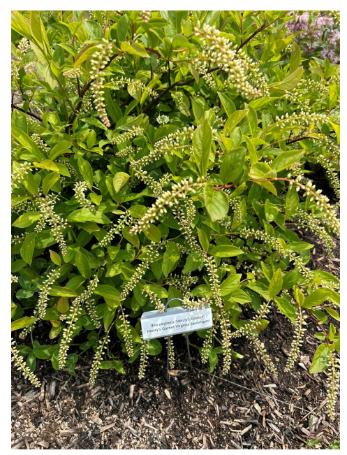
Itea virginica "Henry's Garnet" Henry's Garnet Virginia Sweetspire

For a little gardening inspiration, and to see biodiversity regeneration in action, please visit the Front Yard!