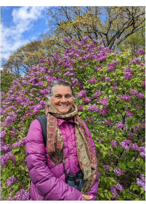
Lilacs blooming in time for Mother's Day!