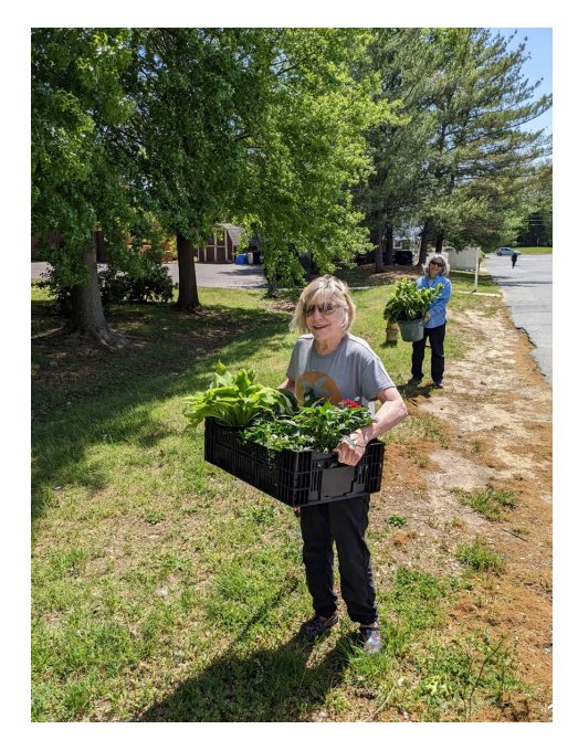
Health Department Garden