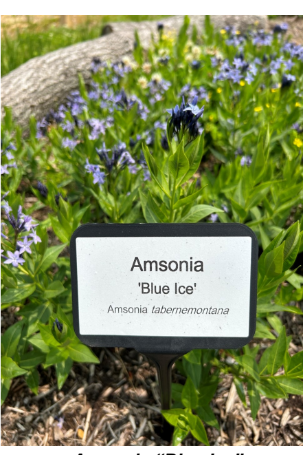
Amsonia "Blue Ice" Amsonia tabernemontana