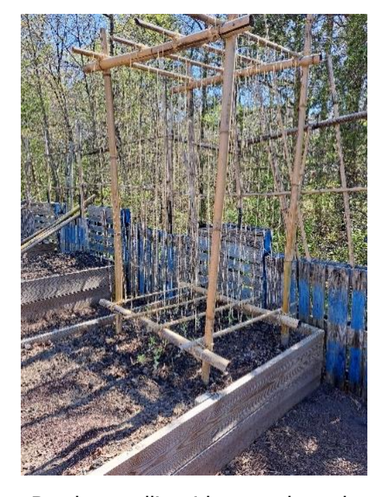
Bamboo trellis with transplanted snap peas.