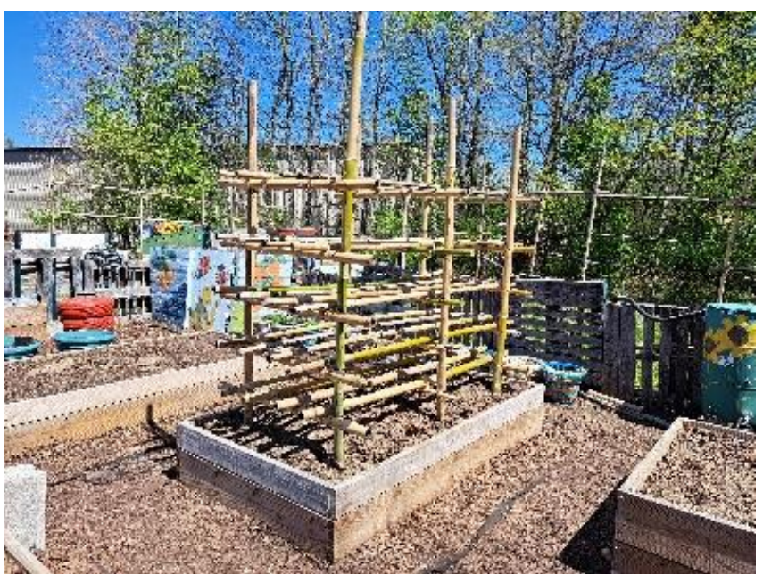
Photo on right: Bamboo trellis for bed of cantaloupe, acorn squash, and butter nut squash.

Top photo shows tiered strawberry beds with several new slips and bee balm on top tier.