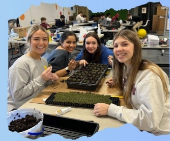
Members of BW Grows!, a 4-H Agriculture Entrepreneurship project recently transplanted 1500 baby plants in preparation for their spring plant sale.