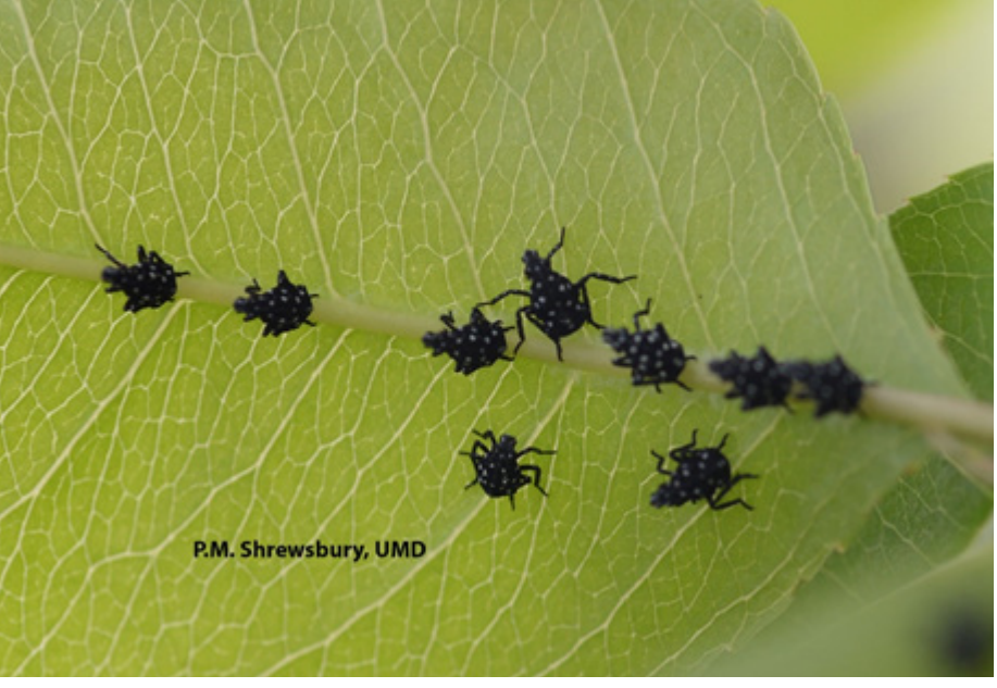
Spotted lanternfly first instar nymphs on the underside of foliage (cherry). You should be monitoring host plants for egg hatch and activity of these first instars. Photo: P.M. Shrewsbury, UMD

Spotted lanternfly nymphs emerging from their overwintering egg mass on the trunk of tree-of-heaven in Hagerstown, MD on April 26, 2023. It took about 1 hour from when the first nymph popped its head out until most of the nymphs were able to crawl away from the egg mass. In a short period of time the white nymphs will harden (melanize) and become black in color with white dots. Photo: P.M. Shrewsbury, UMD