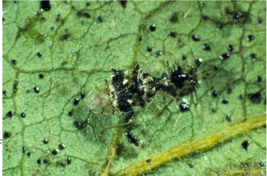
Adult predacious Japanese plant bug, Stethoconus japonicus , (left) feeding on an azalea lace bug nymph (right). Note how well Stethoconus camouflages on the underside of the azalea leaf infested with lace bugs.