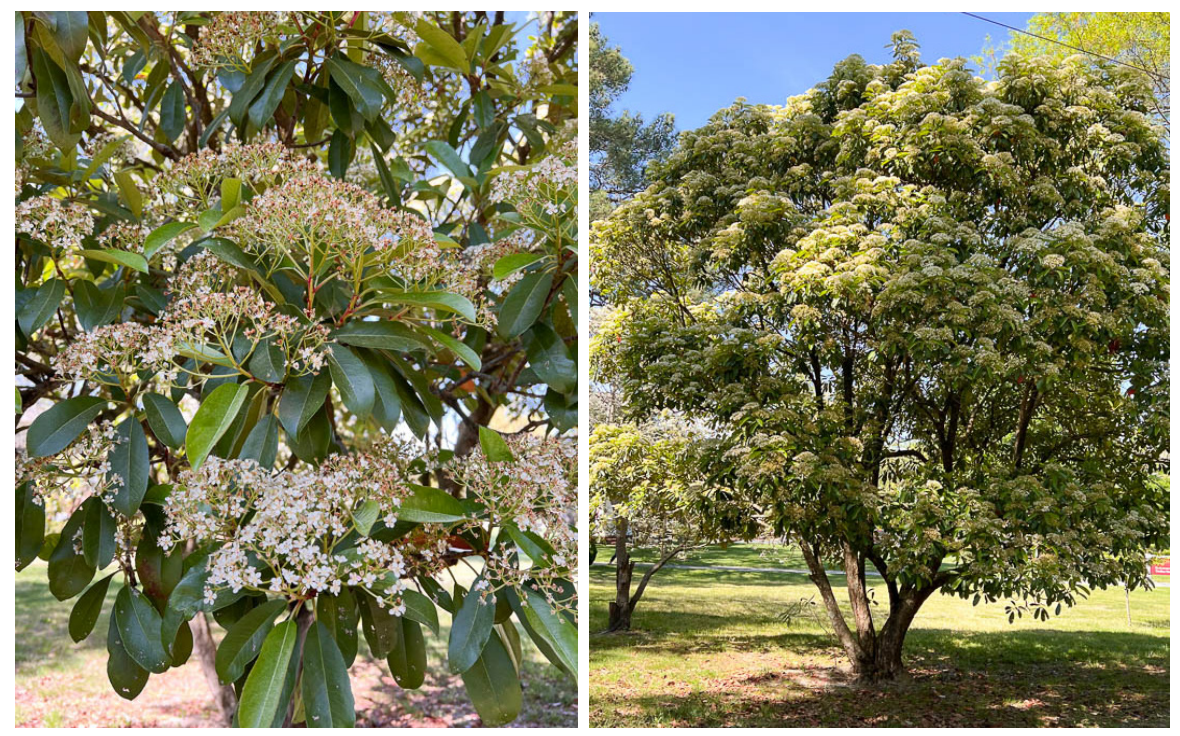
Chinese photinia has attractive flowers that do not have a pleasant odor.

Photinia serrulata or Chinese photinia is winter hardy in USDA zones 6-9, thriving in full sun to partial shade and well-drained soils. It will grow in many soil pH, as long as the soil is not wet. This small tree grows 12-20 feet tall and 9-16 feet wide with 4-8 inch-long, dark evergreen leaves. Each leathery leaf begins with rose-bronze tones before turning dark green and has a finely toothed margin with a prominent mid-rib. Leaves in the fall turn a reddish color and remain on the tree over the winter. The white, 5-petal flowers are held in a flattened bouquet called a corymbose panicle that can grow 4-7 inches wide full of flowers. The flowers do not have a nice fragrance but are attractive, and mature into berries that turn from green to red then purple-brown. The malodorous flowers smell like hawthorn flowers, which gives the plant the other common name of Chinese hawthorn. It should be planted away from foundations and patios. This Photinia is resistant to photinia leaf spot disease, but fire blight and powdery mildew can become problematic. Insect pests can include aphids and scale.