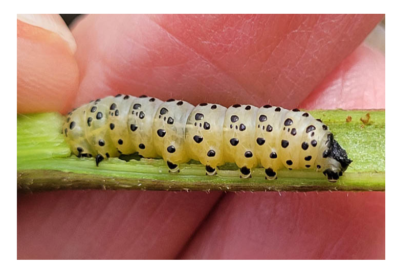
Elder shoot borer causes a shepherd's crook sympton on elderberry.