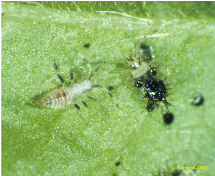
Immature predacious Japanese plant bug, Stethoconus japonicus , (left) stalking an azalea lace bug nymph (right).

examining azaleas with azalea lace bug and its natural enemies (my Ph.D. study system). I frequently observed Stethoconus on azaleas with lace bug but almost always only when there were high densities of lace bugs.