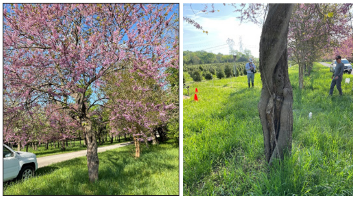
Redbuds are a great early season flowering tree, but they are susceptible to several trunk canker diseases.

They are tolerant of many urban soil types. They are a great flowering tree for early in the season. Redbud trees are members of the Fabaceae or pea family (legume) family, but they do not fix nitrogen. Keep in mind this plant is not a long-lived species. In many circles, it is called a pioneer species. If you get 20 - 30 years out of this species, you are doing well. The redbud trees are extremely susceptible to several trunk canker diseases.