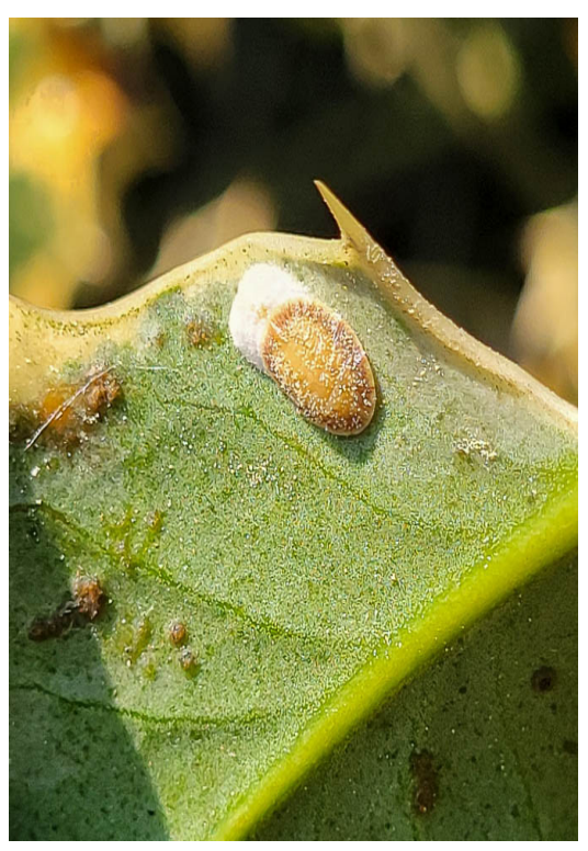
Overwintering females of cottony camellia/Taxus scale (left) are starting to produce waxy egg sacs (right) this week.