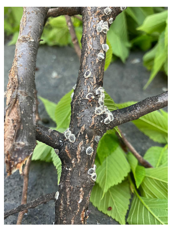
Close-up microscope photo of European elm scale

Dieback on elm from European elm scale infestation and the scale along the trunk of the tree.