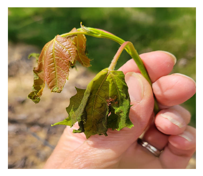
Look for maple petiole borer larvae in the growing tips of maples if you see plants flagging.

Marie Rojas, IPM Scout, is finding damage from maple petiole borer on Maple 'Red Sunset' in Frederick County this week. The damage usually occurs in the spring on new tip growth on 1 to 2 year old maples. Look for flagging tips and prune out damaged branches.