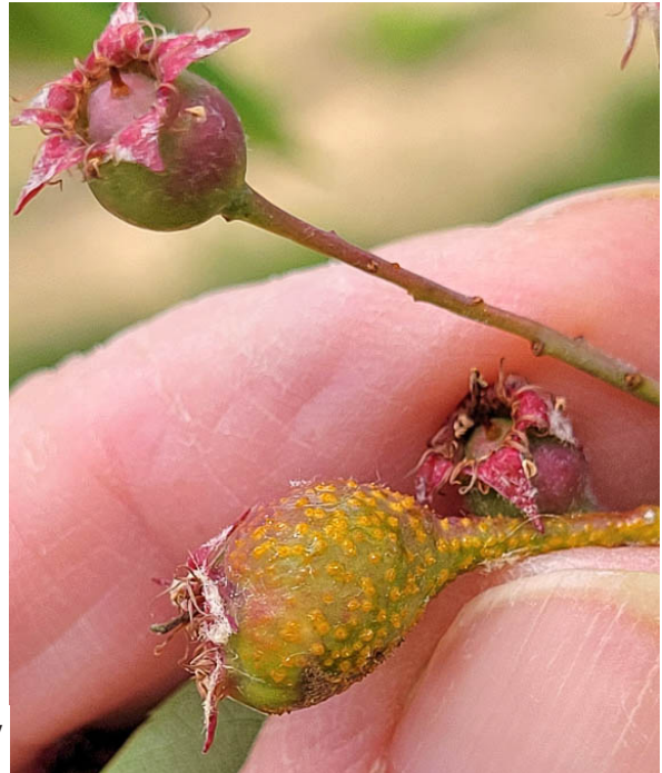
Gymnosporangium rust infection on serviceberry