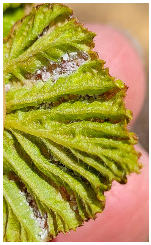
When you see rippled foliage on birch foliage, look on the undersides for spiny witchhazel gall aphids.