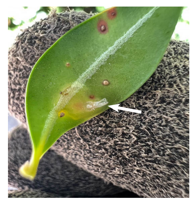
White pupal cases persist on the leaf after boxwood adult emergence.

Nicolas Tardif, Ruppert Landscape, reported that boxwood leafminer adults were active in D.C on April 13. He noted that the flies were swarming around the shrubs. Heather Zindash, The Soulful Gardener, also found boxwood leafminer adults flying in Washington DC on April 11. Both Nicolas and Heather found quite a few adult leafminers caught in spider webs. Here at the research center in Ellicott City, there are no adults. Larvae and pupae can be found within the leaves. Avid is a translaminar material that can be used when this year's larvae are active next month.