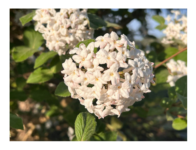
Koreanspice viburnum produces very fragrant flowers.

prefer to grow in USDA zones 4-8, in moist, but well drained slightly acidic soils in full sun to partial shade. Some of the cultivars of merit include Spice Island<sup>TM</sup> which has red-pink buds that open to pure white spicy scented flowers and satiny dark green foliage, Spiced Bouquet<sup>TM</sup>, a compact shrub which has dark rose pink buds that open to fragrant soft pink flowers and glossy green leaves, and Sugar 'n' Spice<sup>TM</sup>, which produces a profusion of smaller bouquets of fragrant flowers and deep green foliage that turns wine red in autumn.