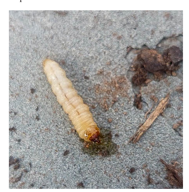
Damage at base of cherry laurel from peachtree borer larvae feeding and the extracted larva.