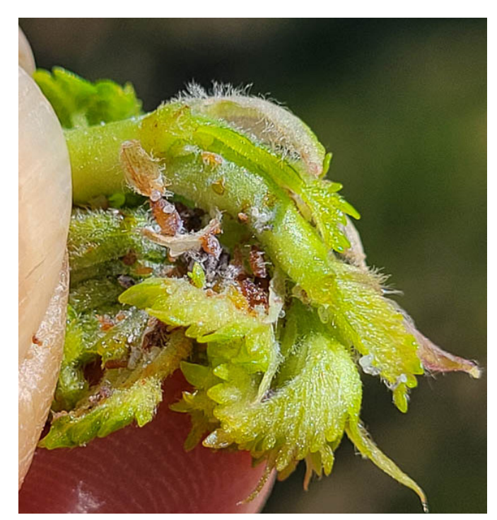
Look within the curled, distorted new leaves of elm for woolly elm aphids.