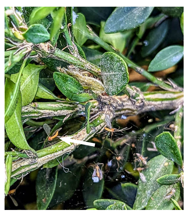
Spiders are active on boxwood shrubs that have a boxwood leafminer infestation.