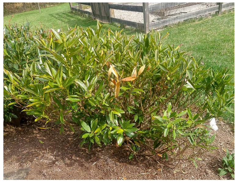
the cambium. According to work done in New York, there are seven instar stages in the development of

The adult female peachtree borer lays between 400 and 900 eggs on the trunk at the soil-line or on weeds and surrounding leaf litter around the base of the trunk. Peachtree borers have an extremely high rate of fertility with about a 97% to 100% peachtree borer egg hatch. The hatched larva bore into the trunk, large roots, or stems. The larva only feed on live cambium and their feeding creates tunnels in the cambium. According to work done in New York, there are seven instar stages in the development of the peachtree borer.