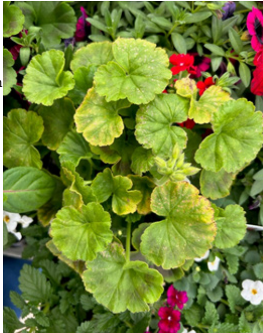
A geranium with suspected iron toxicity. Substrate pH was 4.8.

Sometimes growers need to have two different fertility management programs between iron inefficient plants and iron efficient plants in the greenhouse. If a grower can walk the fine line of managing substrate pH, this may not be the case. Certainly, pH far outside the recommended range is immediately problematic. For instance, the geranium in this photo was in a substrate with a pH of 4.8. While the