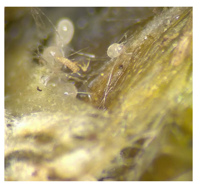
Bulb mites are feeding on the roots of gerbera.

Last month, we received Easter lilies that were infested with bulb mites. This week, the grower brought in gerberas that were also infested with bulb mites. Bulb mites are generalist feeders which can be found on a wide host range of plants. Bulb mites feeds on soft tissue. Keeping substrate on the dry side can help reduce the mites. Stratiolaelaps scimitus (formerly Hypoaspis miles ) are mites used for biological control. If rot is in bulbs, the mites will spread the problem.