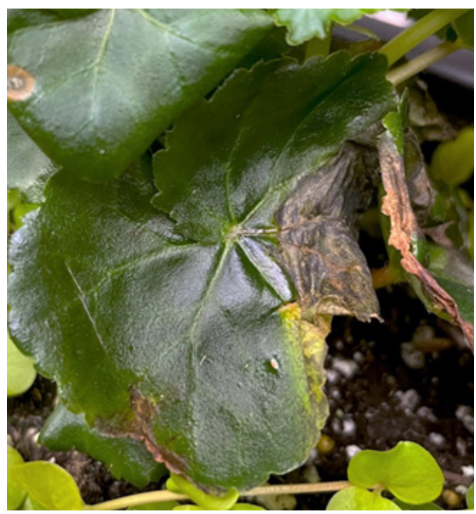
Fig. 2. Closeup of begonia leaf with bacterial leaf

Warm temperatures and leaf wetness favor infection and symptom development. At cooler temperatures, plants may be infected but symptom development is delayed. Overhead irrigation can splash-disperse this bacterial pathogen to adjacent plants.