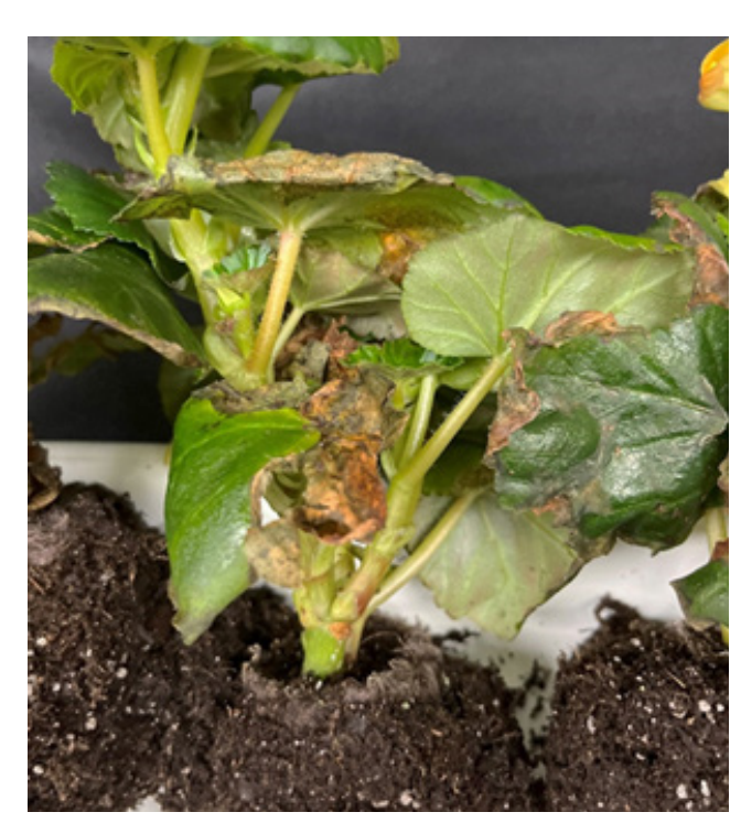
Fig. 3. Begonia with severe symptoms of bacterial leaf blight.