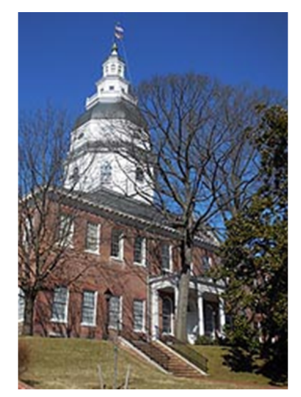
State House, Annapolis, Maryland, January 2014.