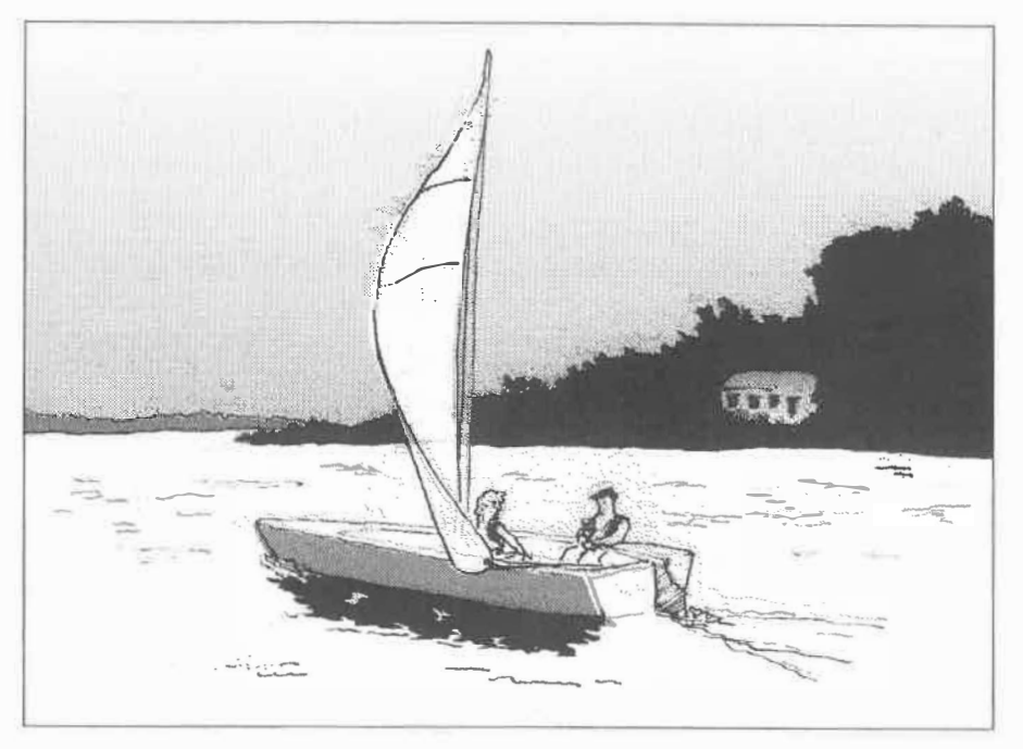
Help protect your local waterways and the Chesapeake Bay. Proper yard care practices can give you a beautiful yard and help protect the Bay!

Emissions from burned fossil fuels deposit pollutants directly on the waters of the Chesapeake Bay, and on the land where they can be washed into streams. Actions taken at home to reduce energy demand can help