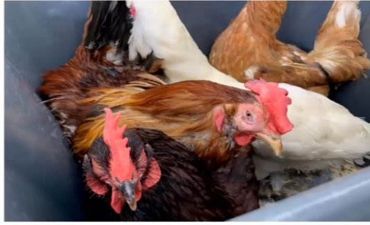
Backyard Flock: Coryza, MG, MS, ILT + by RT-PCR