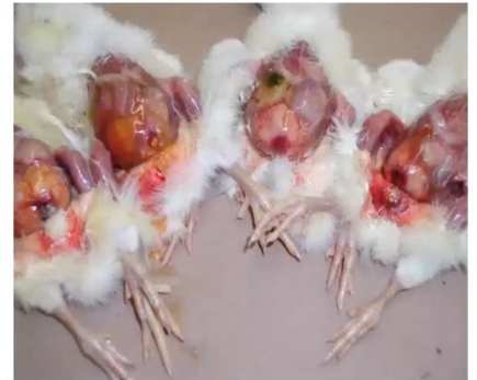
Mostly E. coli isolated