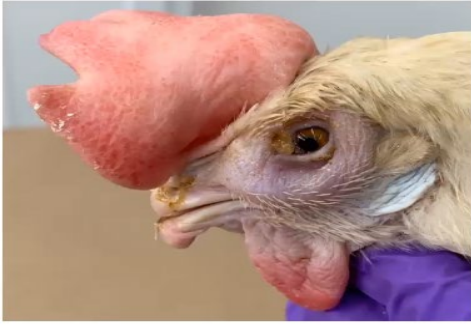
Layer: Coryza, MG, MS+ by RT-PCR