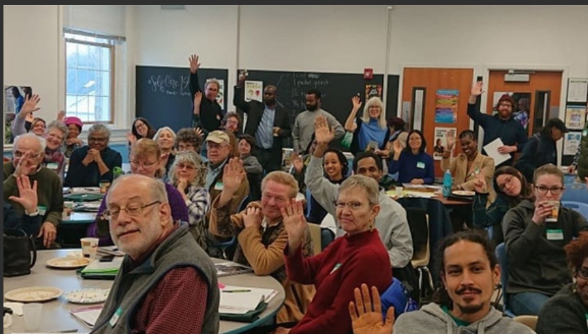
Urban Farmer Meeting