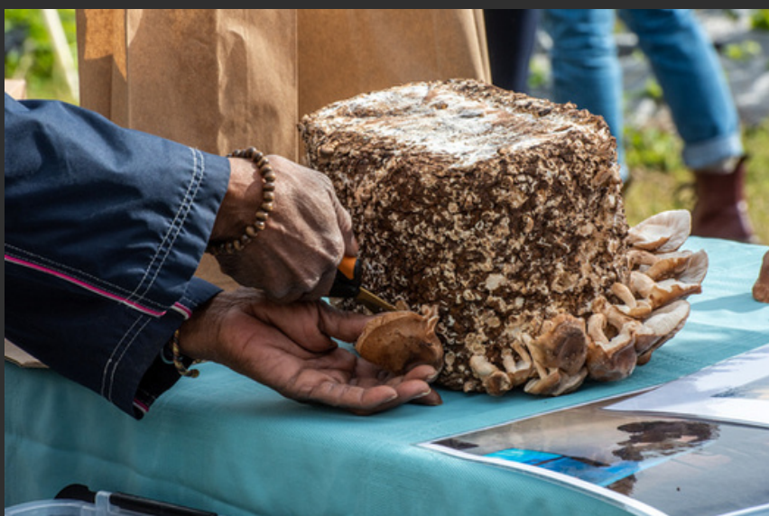
Kimberly Raikes demonstrates how to harvest mushrooms at Extension mushroom workshop at Whitelock Farm