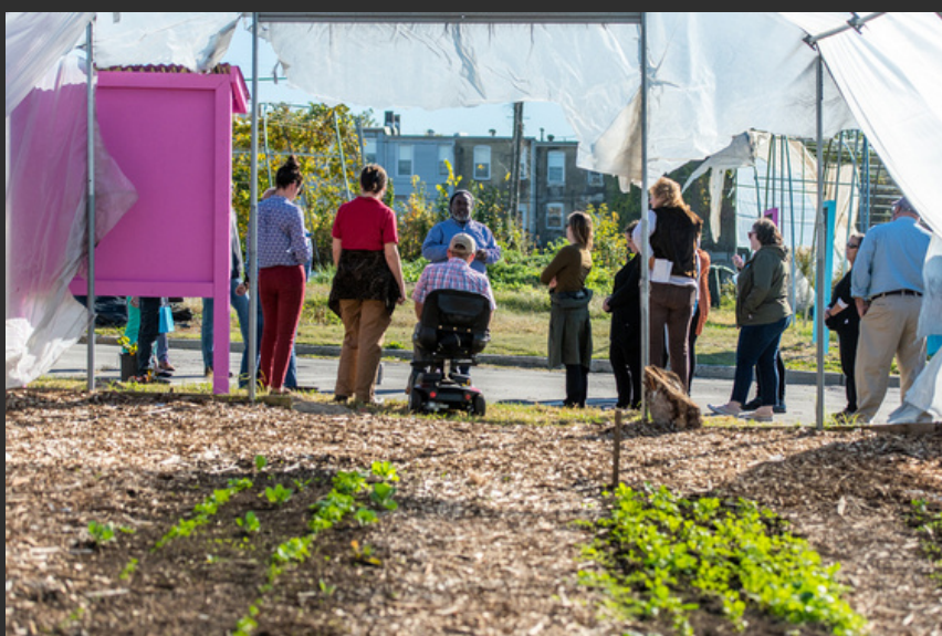
LEAD MD Tour \ Baltimore City Strength to Love 2