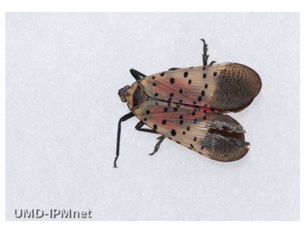
Adult spotted lanternfly

We sent out an announcement from MDA last week. In the announcement, it listed that the spotted lanternfly quarantine area was increased by several additional counties and city (Harford and Cecil Counties have been quarantine areas for the last 2 years) to now include Montgomery, Kent, Anne Arundel, Baltimore, Baltimore City, Howard, Washington, Carroll, Frederick Counties.