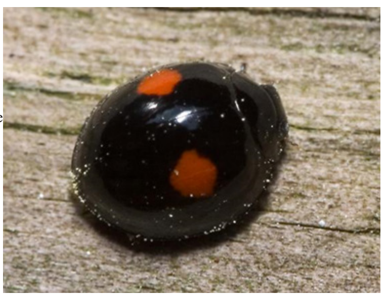
A twice-stabbed lady beetle, Chilocorus stigma , adult commonly found feeding on Japanese maple scale and other scale species.