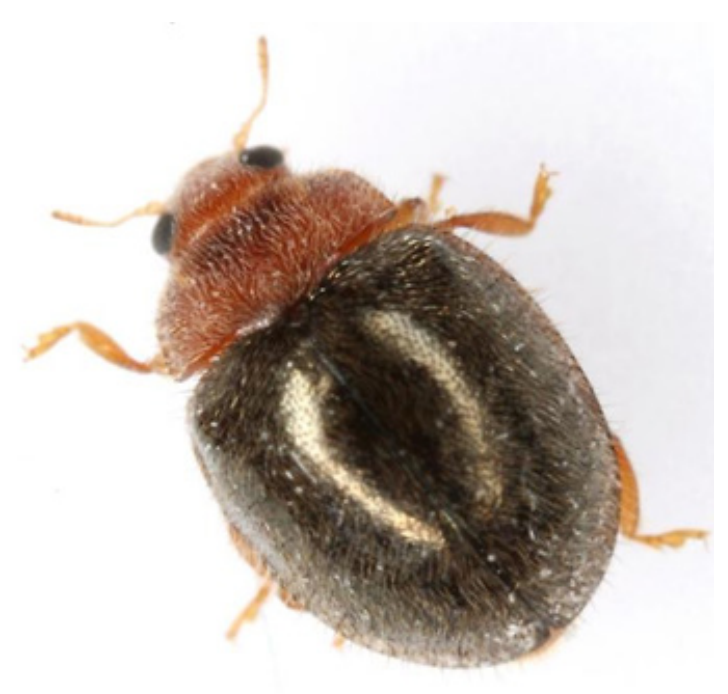
A Rhyzobius lophanthae adult which feeds on armored