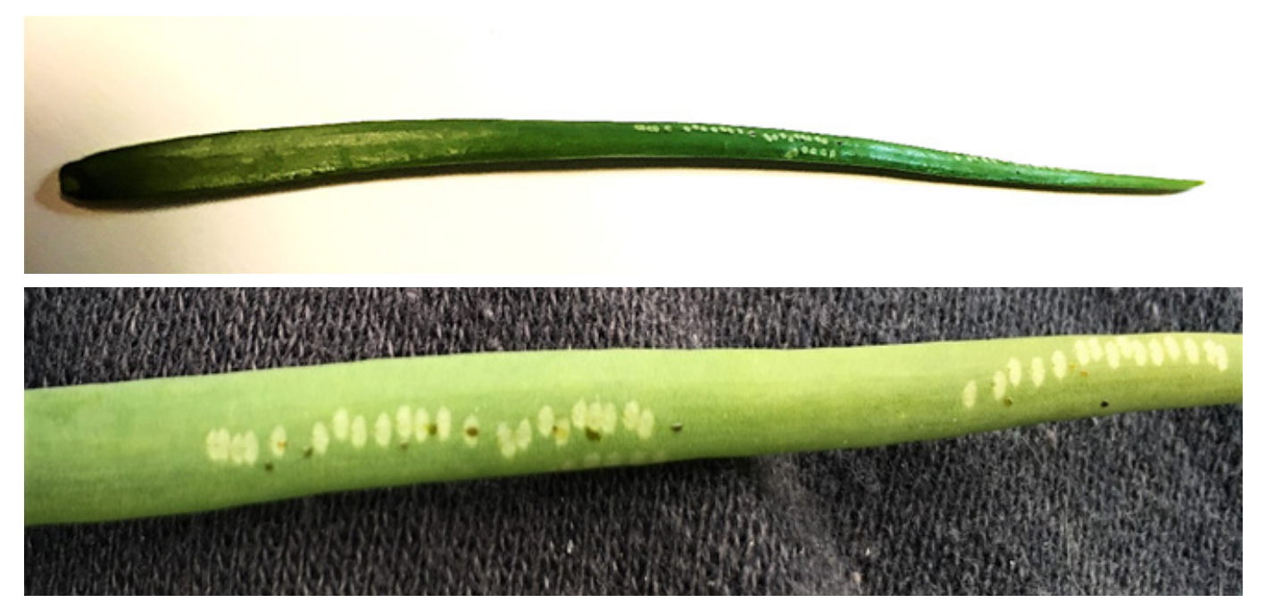
Fig. 1 Onion leaf blades showing round white dots made by female Allium leafminers

Row covers can be used to exclude this pest when Alliums are first planted. A good insecticide to use for control of the larvae is spinosad (Entrust is OMRI-labelled). Entrust is a translaminar insecticide, which means it will be absorbed into the leaf tissue of the plant and held there in an active state so when larvae feed on the foliage they will contact the insecticide. Two or three applications of the insecticide used 2 weeks apart from each other with the first one coming when oviposition marks (white dots) are first seen should give good control of this pest. The use of a penetrant adjuvant is recommended for better control of ALM.