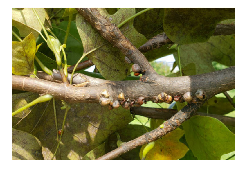
If you have an infestaton of tuliptree scale (above), check to see if crawlers (right) have hatched at your location

Last week in the IPM Alert, we wrote about tuliptree scale. This week, Marie Rojas, IPM Scout, found crawlers starting to hatch under female covers on a tulip tree in Gaithersburg on September 8. Now is a good time to apply Distance or Talus.