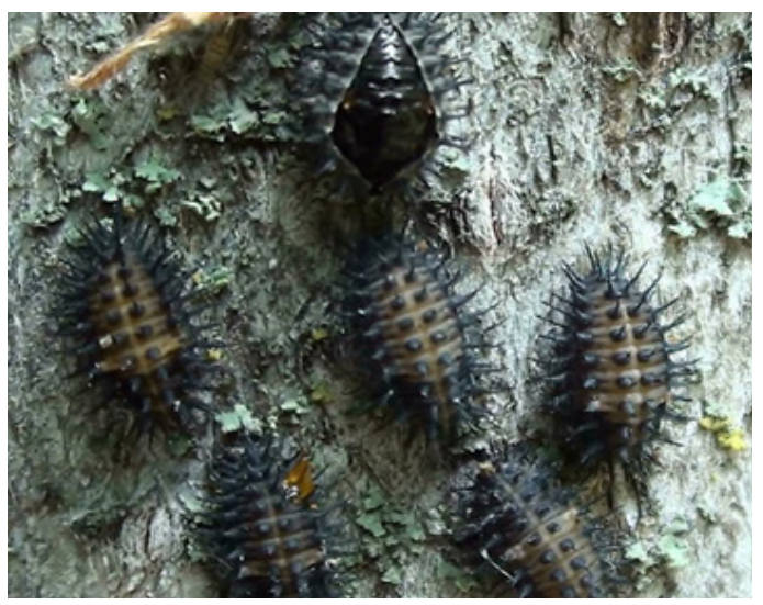
Larvae of the twice-stabbed lady beetle, Chilocorus stigma, are grey and black with spines. Note the pupal stage in the upper part of the image.

Lady beetles and other scale natural enemies occur naturally in outdoor environments. Unfortunately, some management practices and urban landscape and nursery design can disrupt natural enemies, reducing their ability to suppress scales below damaging levels. Practices to conserve these natural enemies should be implemented to provide more efficient and long-lasting suppression of scales below damaging levels. In general, appropriate pesticide selection and use, management of ant populations, and habitat manipulations to favor natural enemies will all help to restore biological control of scales and other plant feeding pests.