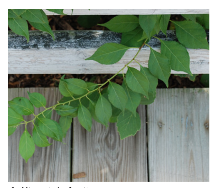
2: Alternate leaf pattern

Oriental bittersweet is an invasive plant. One reason for concern is the color and great numbers of berries produced. As birds are one of the prime methods of dissemination, a brighter red color is very attractive to the birds and with greater numbers of berries to be found, the potential of spread is much higher. To add to this problem, the seeds also seem to have a higher germination percentage than that of American bittersweet.