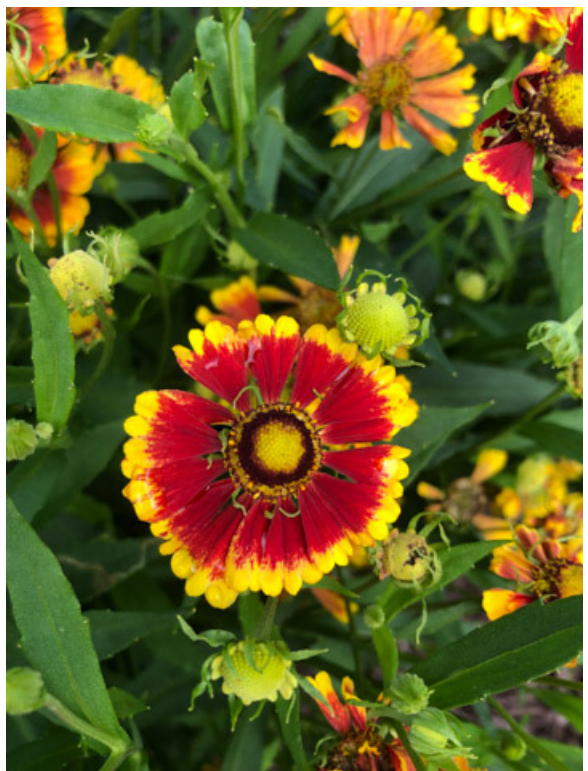
Helenium autumnale 'Helena Red Shades' begin to bloom in August, and flowers into October