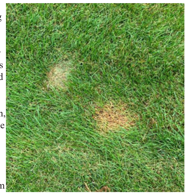
disease spots

There was an inquiry to our horticultural program team concerning turf burn from dog urine. This is a common problem in the lawns of families with pet dogs. Wildlife can also be responsible. Often times these burn spots are concentrated in groups where the family dog does its business. They are typically no more than a few inches in diameter and can resemble pathogen damage like dollar spot and brown patch (Harivandi, 2007). Typically there is a ring of darker green grass around the burn patch. The problem is associated with the high concentration of uric acid, which contains a lot of nitrogen, which causes the dark green edge. The urine is typically acidic. The concentrated nitrogen and other salts in the urine burn the roots of the grass. All turf is susceptible, but fast growing warm-season grasses and tall fescue can more easily grow out of the damage, while other cool season grasses do not. Damage is more common during hot and dry weather when grasses are transpiring water from the soil concentrating the uric acid and salts, or when the turf is not Turf burn from animal urine may resemble actively growing.