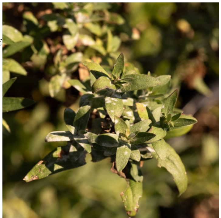
Powdery mildew on aster. Look for late season infections on woody and herbaceous plants

Management: Fall mildew infections rarely require control measures. Select resistant plant cultivars to replace highly susceptible ones. Fungicides will not