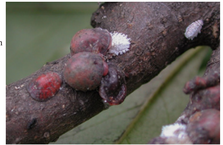
A white waxy Hyperaspis larva has worked its way under a female soft scale and is snacking on her eggs