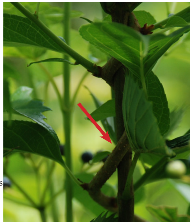
1: Twining growth habit

Control of Oriental bittersweet can be accomplished through either mechanical or chemical means. Cutting near the base can be effective with small plants. As plants mature, immediately use a stem application of triclopyr (Garlon 4) or glyphosate (Roundup and others) at a 25% solution after cutting. Use caution not to apply the herbicide to the desired plant material, as thin barked species can be damaged or killed. In open settings, where possible, apply triclopyr and glyphosate. If possible, mow the site first to create the cut stem. Repeated applications may be necessary. The use of a basal oil and a penetrant will be beneficial and increase the efficacy. Use eye protection when doing stem applications, as some products may cause eye damage. As always read the label for proper 3: Fast growing upright growth PPE.