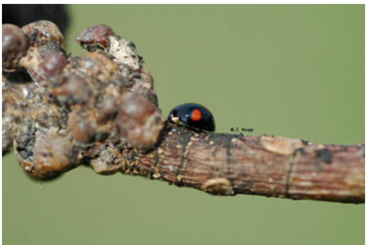
An adult Hyperaspis lady beetle with tulip tree scale

Most of the seven species of Chilocorus lady beetles that occur in the U.S. are predacious and feed on scale insects (armored scales preferred), although some will feed on aphids and adelgids. The twice-stabbed lady beetle, Chilocorus stigma , is the most common lady beetle that feeds on scales. One of the first lady beetles of the season to be active is the twice-stabbed lady beetle. I often see adults feeding on Japanese maple scale, Lopholeucaspis japonica , as early as March. You can see where the name "twice-stabbed" comes from with this predator. Adults appear shiny black with a large red spot in the center of each elytron (front wing) looking like it is bleeding. A narrow ridge or lip extends from the bottom edge of the elytra. Adult beetles average ½" in length.