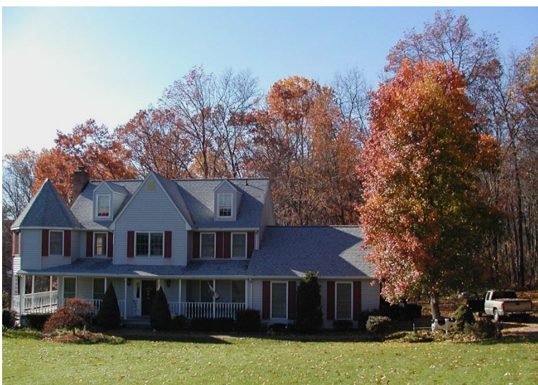
Owners of small-acreage lots with woodlands can benefit from professional assistance in managing their property.

Foresters with at least a Bachelor of Science degree and two years of practical experience under the guidance of a licensed forester. Foresters on this list are Licensed Professional Foresters with the State of Maryland's Board of Foresters within the Department of Labor, Licensing and Regulation