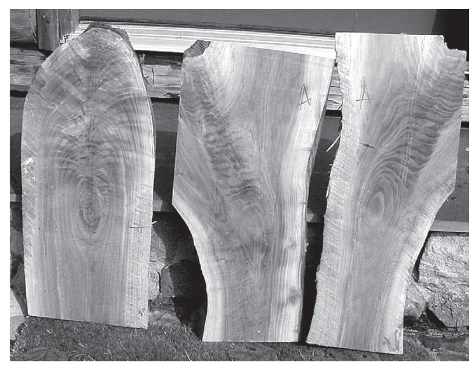
Specialty cuts such as the burl on the left and book-matched black cherry pieces on the right may be cut from a log not useful for traditional dimension lumber.

A bit of sage advice shared by experienced owneroperators is, "Don't expect to be able to outcompete prices offered by retail lumber dealers." If you are to stay in business and make a profit, you must be able to offer something that your competition (retailers or other portable sawmill owners) can't. Find your