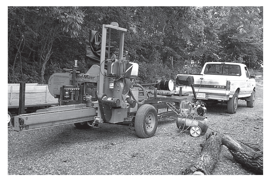
When you buy a mill, you'll have to decide whether to get the trailer package. The ability to bring the mill to the site is a major appeal to many customers.

Most new portable mills range in price from around $5,000 to $35,000. New manual mills (you load the logs and push the bandsaw through the log) run about $5,000 to $12,000, while fully hydraulic mills (load and turn logs, powered carriage-feed drive) cost about $16,000 to $35,000. Production for the manual mills is only about 1,000 board feet per eight-hour day, while hydraulic mills may cut 3,000 board feet per day. Commercial mills for professionals may cost from