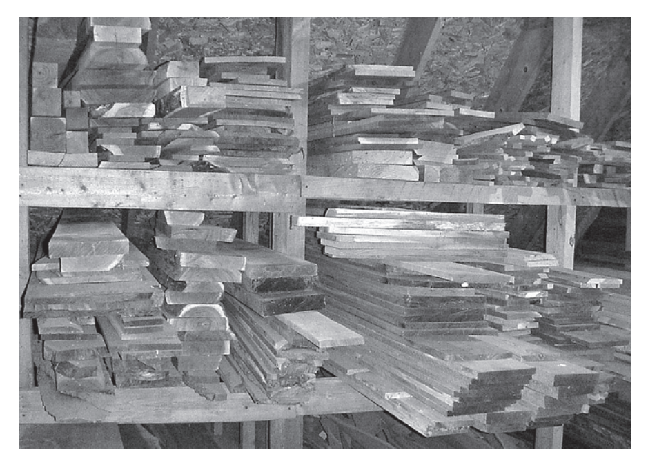
Kiln-dried lumber can be marketed tocabinetmakers, crafters, and hobbyists through a number of marketing methods.

foresters, loggers, plumbers, electricians, carpenters, appliance repairmen, cooperative extension offices, chainsaw dealerships, farm equipment dealers and servicers, and even other sawyers know of your business. Create a Web page for your business. Look for opportunities to demonstrate your mill and your services at trade shows, forestry workshops, dealerships, and county, agricultural, and forestry fairs. Post a sign at sites where you are sawing so passersby can get in touch with you if they are interested in your services.