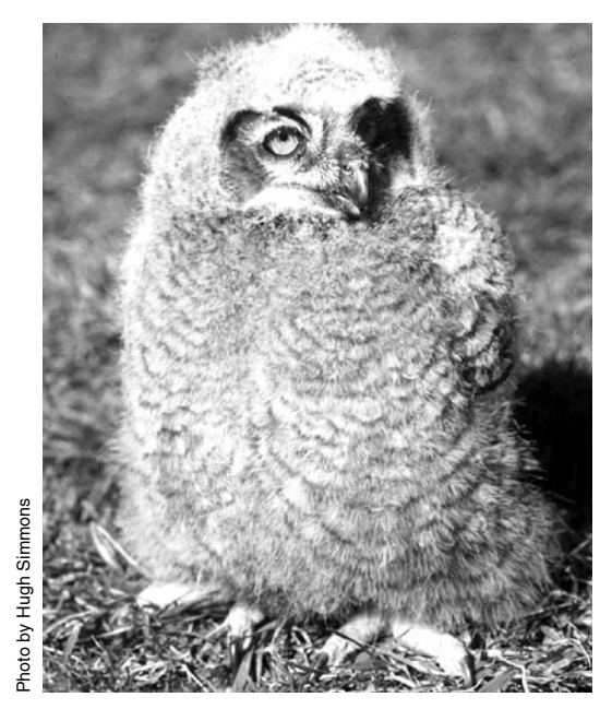
Baby Great Horned Owl

on cliffs, in trees, on power poles, on towers, and the list goes on. It is thought that two main factors influence whether an area is suitable for habitation by Great Horned Owls-an available nest site and an adequate amount of food. For this reason, they can be attracted to human constructed nest structures in areas that have an adequate supply of small mammals. Like most other owls, they do not make their own nest. The owls will require a nest to be already constructed for them. In most cases, they take the nest of a red-tailed hawk or other large diurnal (daytime active) raptor. Great Horned Owls nest much earlier (end of January into February) than red-tailed hawks and therefore can lay claim to a nest previously built by hawks before they arrive to breed.