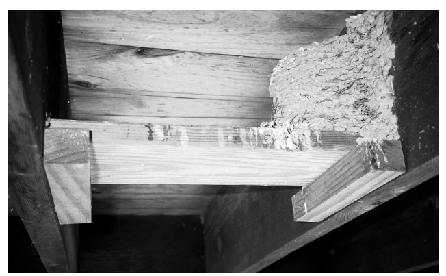
Figure 1. Barn Swallow nest.

to allow enough space between the shelf and the ceiling to allow a nest to be built up several inches. As seen in Figure 1, a board attached to the joists is an easy way to provide nesting opportunities for Barn Swallows and is also located in an area where bird droppings are not a concern.