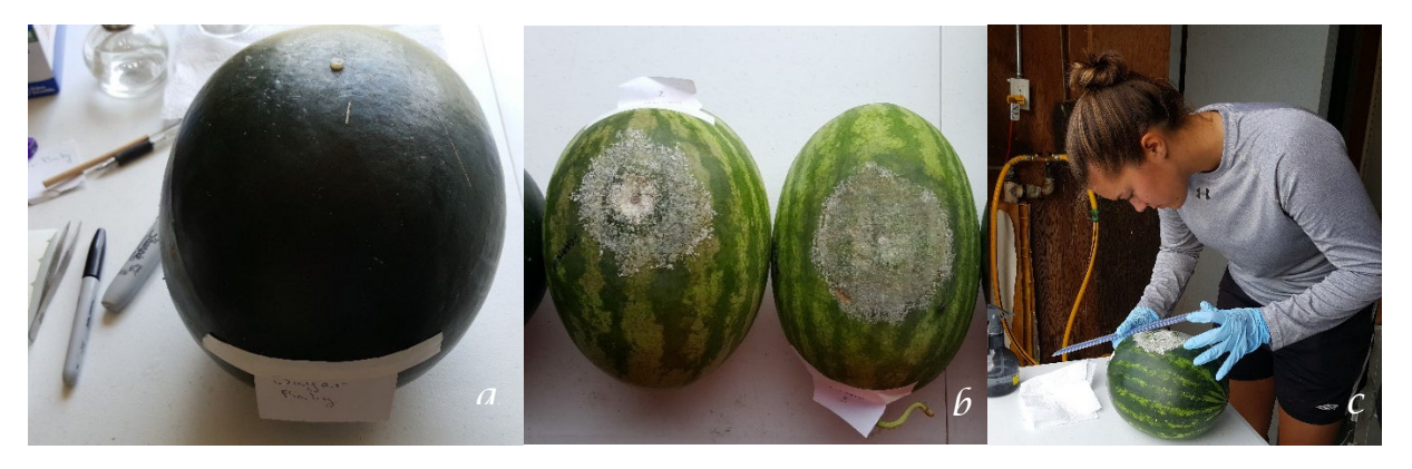
Figure 1 a) Inoculation of watermelon fruit with P. capsici ; b) Lesion development and sporulation on different cultivars; c) Plant pathology technician, Taylor Walter measures lesion and sporulation size.

The lesion diameter was large on all fruit and there were no significant differences in lesion diameter among the cultivars in either set. In the first set (Table 1) there were significant differences in pathogen growth diameter among the cultivars. However, the area that sporulated was still large and may not provide any benefit in field production. The sporulation intensity was high among cultivars, and in the first set, significant differences in sporulation intensity were observed from a low of 1.8 in Summer Breeze and Cut Above, to a high of 4.5 in Sugar Baby. There were no significant differences in lesion diameter, pathogen growth diameter, or sporulation intensity among cultivars in the second set tested.