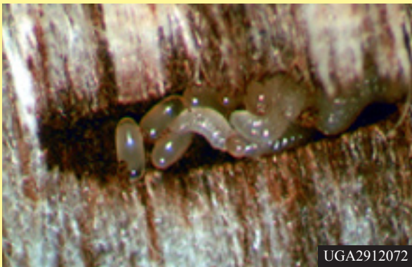
Eggs and larvae in gallery.