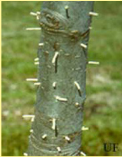
Frass spikes.