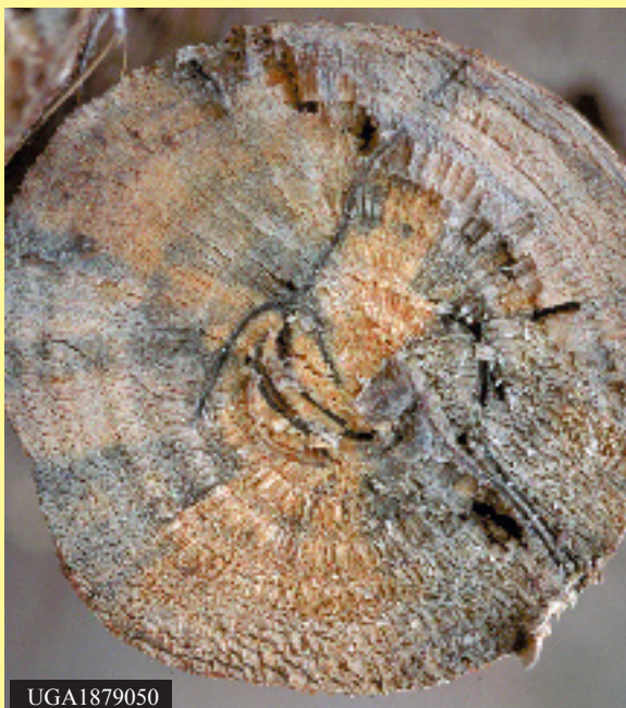
Typical galleries and fungal staining.