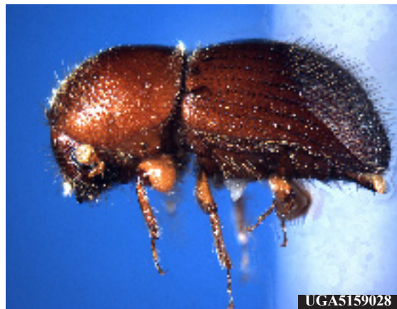
GAB adult.

GAB is currently found in China, East Africa, India, Sri Lanka, Japan, Southeast Asia, Indonesia, New Guinea, South Pacific islands, and throughout much of the United States, including Hawaii. As of 2007, GAB has spread throughout the southeastern and Gulf coasts from the Carolinas to Texas, through Oklahoma and Arkansas, and into Tennessee, Virginia, Maryland, Delaware, Ohio, Indiana, and Oregon. GAB has spread naturally and by shipment of infested nursery stock, wooden crating and packing material, and raw wood products (e.g., rail ties, logs, lumber, firewood).