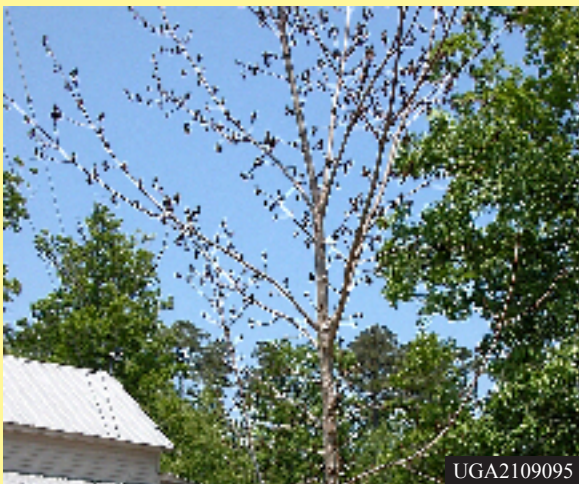
Damaged tree.