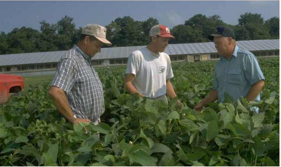
Limited partnerships allow for investments by limited partners who can invest in the business and will only be liable for that investment--not full liability.

As you are beginning to see, not all business organization structures are created equally. Some offer little or no protection to shield personal assets from business liabilities. Sole proprietorships and general partnerships are two of the very basic structures offering limited protections. The next business