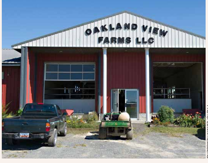
LLCs allow any entity, including individuals, partnerships, trusts, estates, corporations, or other LLCs to be owners.

LLCs offer greater flexibility than corporations because they lack restrictions on number of members allowed but have the tax advantages (or disadvantages) of a partnership, such as pass-through of taxable income and losses. The IRS does not consider an LLC a distinct and separate entity for tax purposes. What this means is that the IRS does not tax the LLC directly; instead the members of the LLC decide how they want to be taxed. Typically, members of an LLC create an operating agreement outlining how they would like to be treated for tax purposes. Please see IRS.gov for further information regarding taxation of LLCs.