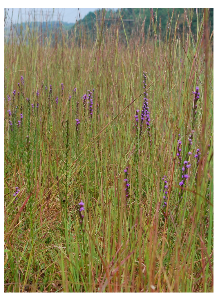
Shaggy blazingstars blooming in a field of little bluestem.

Some plant species are particularly successful in the anthropogenic meadows of Maryland's Coastal Plain. Anthropogenic meadows are areas that lack the tree cover typical of the Eastern Deciduous Forest because of human activity. Examples can be seen along roadsides, under utility lines, or where pastures or crop fields have been abandoned. The meadow species that thrive in these areas are well adapted to human disturbance and require