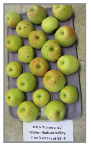
Figure 5. To approximate the incidence of bitter pit in an orchard block, gather 100 apples three weeks before harvest and keep them at room temperature. The number of apples with bitter pit in the sample will help determine whether to store the apples or market immediately for the corresponding orchard block.

Although bitter pit is linked to an imbalance of calcium within the fruit cells, the disorder is also influenced by competing nutrients and various other factors. Foliar calcium sprays have a low uptake and are best used as a complement to other practices but are still essential to perform as they can reduce bitter pit development. To manage nutrient imbalances as fruits develop, prioritize rootstock selection, pruning, and thinning. Plant growth regulators and early harvests can increase bitter