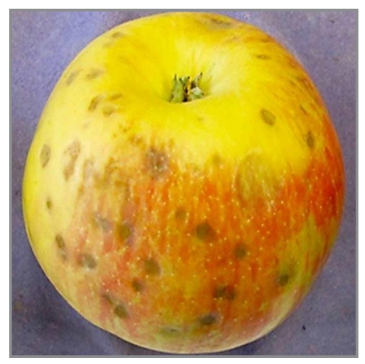
Figure 2. Bitter pit on Honeycrisp apple after harvest.