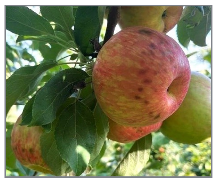
Figure 1. Bitter Pit developing on Honeycrisp apples in the orchard.

Calcium is taken up by roots along with other nutrients (such as potassium, magnesium, and nitrogen) and transported up the tree through transpiration via the xylem. Then it is divided between transpiring organs,