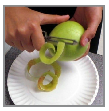
Figure 3. Peel sap analysis using two peels from 30 golf ball-sized apples can assess the bitter pit risk in the developing fruit.

In July, collect 30 fruitlets when they reach a size of 50-55g/fruit. Remove the stems and clean the fruitlets using a paper towel dampened with purified water. Allow the fruitlets to dry completely after cleaning. Peel from the stem end to the calyx end, on two opposite sides, to collect two peels per fruitlet (Fig. 3). Place the peel samples in a freezer bag labeled with the farm name, grower name, contact information, and sampling date. Press air out