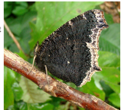
Fig. 4 An adult mourning cloak butterfly with wings closed. Note the darker coloration that helps this butterfly camouflage.