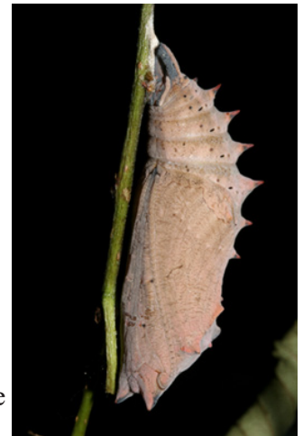
Fig. 3. The pupal stage (chrysalis) of a mourning cloak. Up to 7/8” in length.