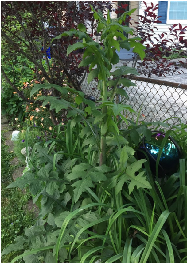
Prickly lettuce growing in the landscape Photo 5

Control of this weed can be obtained using most systemic weed control products. In open areas 2,4-D containing products work very well. In landscape and nursery settings, Dicamba (Banvel D), and Bentazon (Prompt) are labeled to control this weed as post emergent herbicides. Ornamental Herbicide 2 (pendimethalin plus oxyfluorfen) and Rout (oryzalin plus oxyfluorfen) are noted to be useful as pre-emergent products. Note that some herbicide resistance has been noted in the agronomic sector. Use caution with the use of post emergent products as some have the ability to volatilize and move from the intended site.