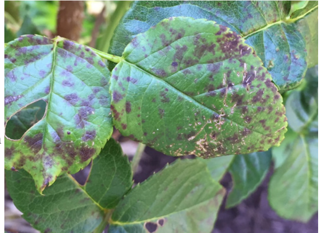
Fig. 1 Black spot on rose

Ginny Rosenkranz reported both black spot and powdery mildew are occurring now on roses. Hybrid tea roses are particularly susceptible to these diseases, and management takes an integrated approach. The names of these diseases accurately describe their symptoms and signs (see Fig 1 and Fig 2). Black spot symptoms develop as dark lesions with feathery margins. Infected leaves can turn yellow and drop, even with only a few lesions present. White, powdery growth of mycelium and spores on leaves and stems is typical of powdery mildew. Chlorosis and leaf distortion can occur when young leaves are infected with powdery mildew early in the season.