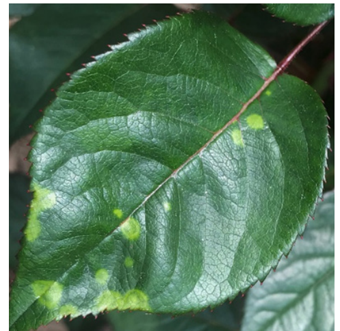
Figure 3. Line patterns (left) and chlorotic spots (right) symptoms of rose mosaic disease.