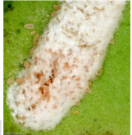
Check cottony camellia/taxus scale infestations for crawlers

Cottony camellia/taxus scale is now in the crawler stage on hollies. Treat crawlers with pyriproxyfen (Distance) or buprofezin (Talus) mixed with 0.5 - 1% horticultural oil.