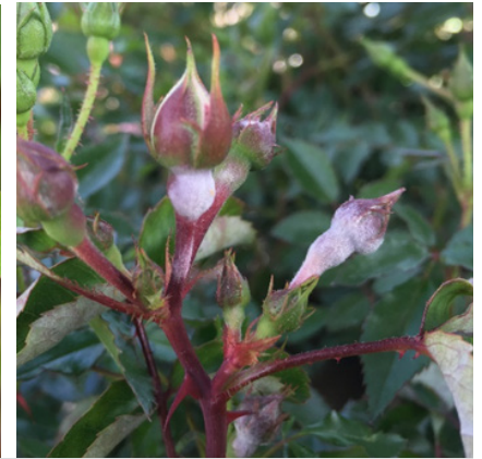
Fig. 2 Powdery mildew on rose foliage and flower buds