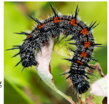
Fig. 2. A late instar (stage) caterpillar of a mourning cloak butterfly. Caterpillars can grow to 2" in length.