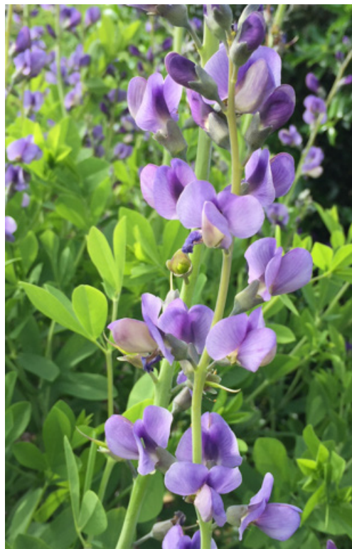
Baptisia in bloom