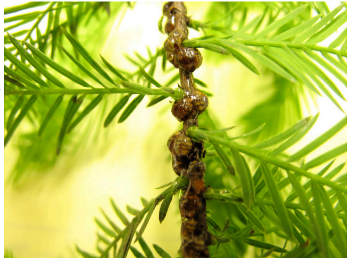
Fletcher scale is all along this bald cypress stem

Arborvitae, especially Thuja 'Green Giant' and 'Emerald Green' have become the darlings of the nursery and landscape trade. Yes, I have them lining my neighbor's property line like everyone else. It is a great plant that looks good, grows fast, and works to screen out neighbors. You know that I am almost always leading back to an insect. This insect is Fletcher scale, Parthenolecanium fletcheri (Cockerell). This soft scale is showing up more and more in samples we are receiving from landscapers and arborists. The problem is that the overwintering form of this scale is oval-shaped, somewhat flattened, and tends to blend in well on the stems. This pest overwinters as second instar nymphs. Plant propagators are taking vegetative cuttings and rooting them with small populations of scale present. It goes into the nursery where the scale population continues to increase. ALERT