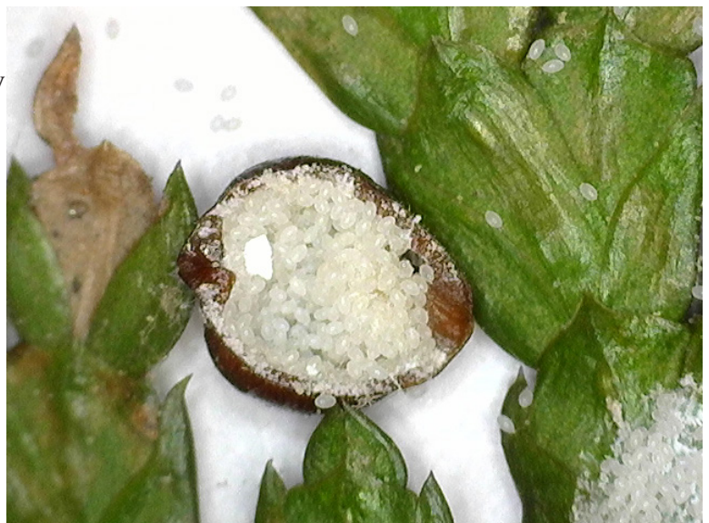
A fletcher scale cover was flipped over to reveal the eggs underneath

If you are a nursery manager, please examine arborvitae and taxus yews in your nursery and bring this pest under control before it moves out into the landscape. Large plants in the landscape are going to take a lot more material to obtain control as these plants size up in the landscape.