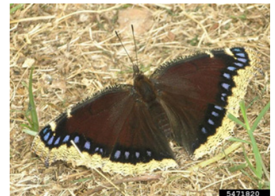
Fig. 1. An adult mourning cloak butterfly. These are large butterflies with wing-spans that range from 2 7/8" to 3 3/8".

As the temperatures warm through mid-spring, mourning cloaks will be visible most days. However, as all of you know, mid-April is not a floral bonanza in the mid-Atlantic. What do these early season mourning cloaks eat? Tree sap! With warmer weather, trees are relocating their stored sugars from the roots back to the shoots. Butterflies take advantage of this flowing sugar and use their proboscis to probe and suck sap from between segments of bark, storm-damaged trees, and broken branches, especially of oak species. Other, less glamorous food sources are rotting fruits and mammal feces, from which the adult butterflies absorb important nitrogen-based nutrition. (View this video of California tortoiseshell butterflies feeding on