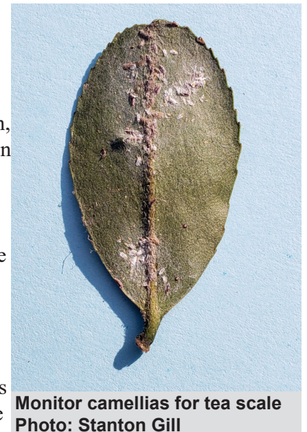
Monitor camellias for tea scale

Landscapers are starting to install more camellias that have better winter hardiness. I have been growing Camellia japonica 'Jerry Hill' and 'Ashton Delight' for over 15 years which have survived the polar vortex and polar express winters. Of course, as these plants become more popular, we see problems cropping up. An armored scale called tea scale, Fiorinia theae Green, shows up on the foliage of camellia. In southern states, it is a major problem on camellias. We only occasionally saw this scale as a problem here in Maryland. With hardier varieties of camellias moving into the market and more being moved into the landscape, the number of infestation cases is increasing. Many of the camellias used in landscapes are supplied from southern nurseries where camellias are propagated and grown for market. Unfortunately, this armored scale is coming along for the ride.