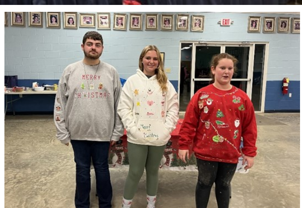
Holiday Shirt Contest participants