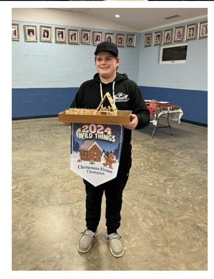
Champion Grahm Cracker House