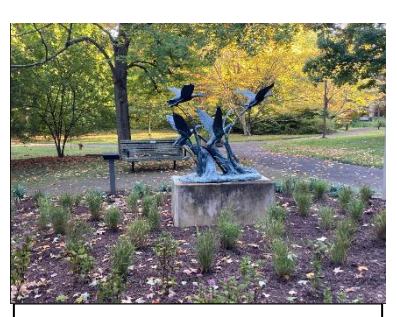
Native grasses surrounding statuesque art.

Phase 4 of the Plant Mural transition at Tawes Garden was very successful, thanks to the efforts of Master Gardeners and volunteers from the Friends of Tawes Gardens Board. This project is led by cochairs Cindy Wells and Kathy Devine. The Tawes Native Pollinator Plants Garden is a beautiful demonstration-habitat garden now, thanks to their collaborative efforts!