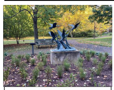
Native grasses surrounding statuesque art.

Phase 4 of the Plant Mural transition at Tawes Garden was very successful, thanks to the efforts of Master Gardeners and volunteers from the Friends of Tawes Gardens Board. This project is led by cochairs Cindy Wells and Kathy Devine. The Tawes Native Pollinator Plants Garden is a beautiful demonstration-habitat garden now, thanks to their collaborative efforts!