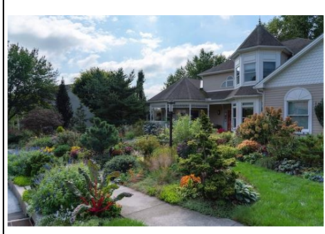
This is the front yard in fall at Kevin Kelly's award-winning garden in Lower Paxton Twp.

A Four-Season Garden: A Photographic Tour