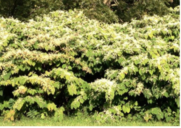
Japanese knotweed flower close-up (above) and taking over an area (bottom).