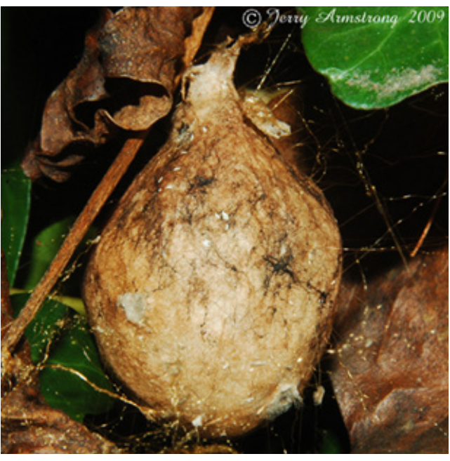
An egg sac of the black and yellow garden spider Egg sacs are round in shape and about the size of a ping pong ball.

Be careful as you are walking between rows of nursery trees or among landscape trees and shrubs. It is a little disturbing to get the black and yellow garden spider's web in your face, and the spider has worked pretty hard to make that web for the day!