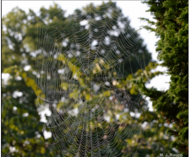
A fine morning mist reveals the beautiful web of an

flies, bees and wasps, moths, or other flying insects. Also interesting,