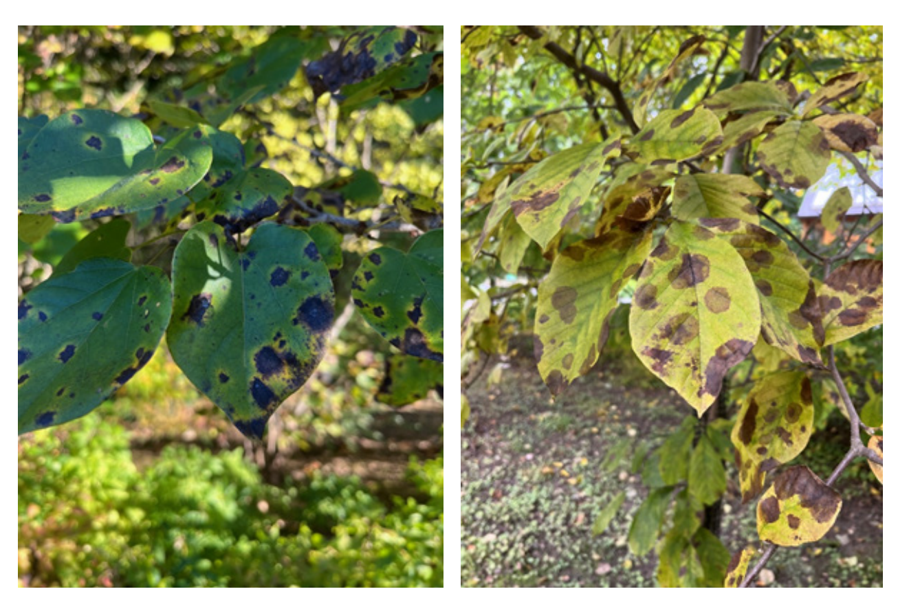
Late season leaf spots on redbud (left) and magnolia (right).

At this time of year (late September-October), landscape plants can develop unusual leaf symptoms such as brown or yellow spots or blotches in addition to the overall color change we expect in the autumn months. There are a number of weak fungal pathogens that can attack leaves late in the growing season, but these have little impact on the overall health of the affected plant.