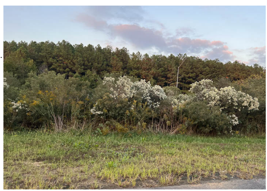
Salt bush growing on the roadway.

Baccharis halimifolia, also known as groundsel or salt bush, is a native plant that thrives near the sea coast and tidal waters, but also on roadways that in the winter get covered in life saving salt to reduce accidents. Salt bush thrives in full sun and wet to moist sandy soils and can be found on roadsides, along ditches, salt marshes and disturbed areas, being very tolerant of heat, drought and salt sprays. These deciduous shrubs can grow 3-10 feet tall and wide, with a multi trunk growing in an open and airy habit and are cold tolerant in USDA zones from 5 to 10. The salt bush is dioecious, with a male plant and a female plant that flowers and sets seeds. The thick 2 inch long 1.5 inches wide grey-green leaves are elliptic in shape with a serrated margin and are dotted with resinous glands. They are attached to the stems in an