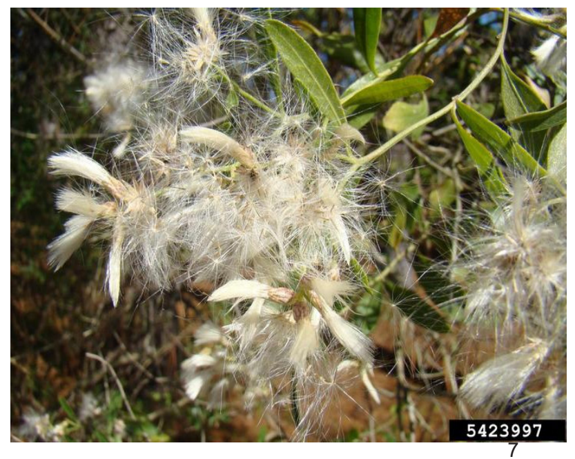
Salt bush flowers are in bloom August through October.

alternate fashion. The narrow tubular white-green female florets are held in terminal clusters about 3 inches across and the nectar attracts many bees, butterflies and other pollinators. They bloom from August to October before maturing into seeds that are topped by silvery white feathery plume like seeds that catch the winds during the winter months. The seeds are very viable and dispersed by wind, which can make them weedy if the seeds fall into landscaped areas. Birds also enjoy the seeds in winter. Salt bush can be used in Rain gardens, retention basins, on the edges of ponds, in seaside gardens, as a hedge or trained into a single trunk specimen. There are no serious pests, although the seeds are very viable and can create aggressive seedlings.