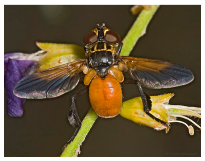
Feather-legged tachinid fly adult. This tachinid species usually attacks true bugs (Hemiptera: Heteroptera), including squash bugs, leaf-footed bugs, plant bugs, shield-backed bugs, and stink bugs. Note the orange abdomen, large yellow-orange halteres (pair of structures in place of hind wings of true flies), and the feather-like hairs on their back legs.

Regardless of the egg laying strategy, all tachinid flies are internal parasitoids of their hosts as larva and they exit the host body to pupate. If you ever see a Japanese beetle adult that looks like its abdomen has been "blown out", it was likely killed by a tachinid fly. Tachinids can have one to multiple generations a year. Some tachinid species have been introduced in classical biological control programs to control exotic pest species such as Japanese beetles. At this time, there are no commercially available Tachinids for use in augmentative biological control. Adult tachinid flies have sponging-lapping mouthparts that they use to feed on sweet liquid such as nectar from flowers and honeydew from aphids and soft scales. This adult food resource (nectar) suggests conservation biological control efforts to build tachinid populations can be used. In our studies on the use of flowering plant conservation strips to conserve beneficial arthropods, we frequently observe tachinid fly adult activity on flowers. Keep working towards conserving natural enemies to help the beneficial insects suppress pest insects.