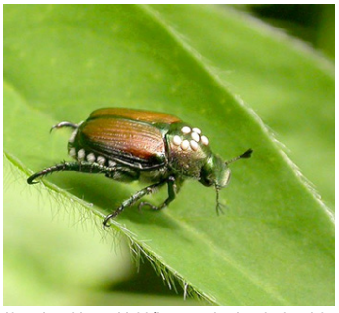
Note the white tachinid fly eggs glued to the beetle's pronotum (section behind the head) by an adult tachinid female. Eggs will hatch and larvae will burrow into the Japanese beetle and feed on its insides resulting in its death.