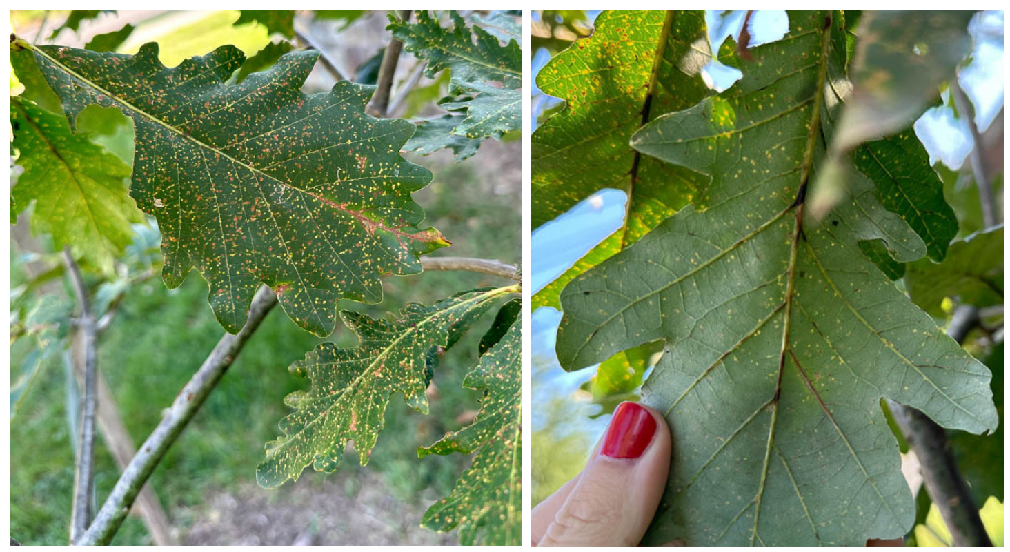
Oak phylloxera damage is visible on the upper and lower leaf surfaces.

Kaitlyn Camp, Casey Trees, found oak phylloxera on a Quercus bicolor in Washington DC. on September 9. Oak phylloxera are aphid-like insects that have sucking mouthparts. They cause round spots that start out yellow and turn brown. These yellow and brown spots will be on both the upper and lower sides of the leaves. Although unsightly, control is not necessary. There are various predators such as lacewings and lady beetles that feed on this insect.