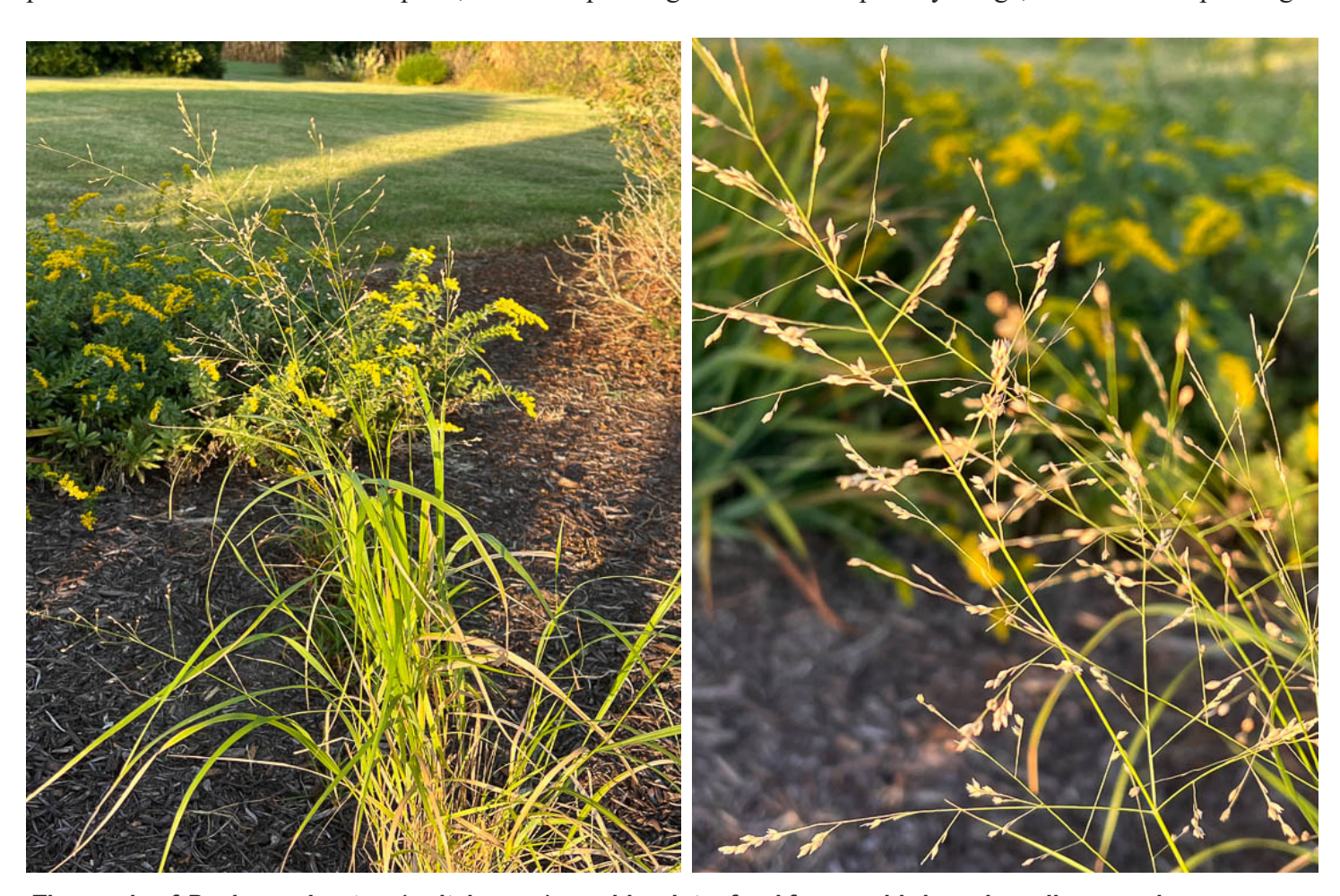
The seeds of Panicum virgatum (switchgrass) provide winter food for songbirds and small mammals.