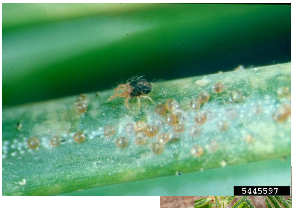
Spruce spider mite and eggs.

With the cool weather showing up last week, spruce spider activity has increased on spruce, junipers, and Leyland cypress. A 2% horticultural oil can be applied to all but blue spruce to control these mites.