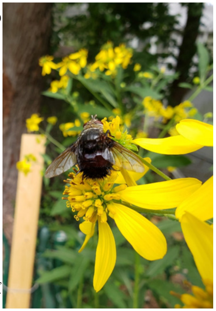
feeding on the floral resources provided by wingstem (Verbesina alternifolia) flower, is also known to feed on a diversity of flower species. This demonstrates that "if you grow the right plants, the abdomen that are characteristic of tachinid fly adults.