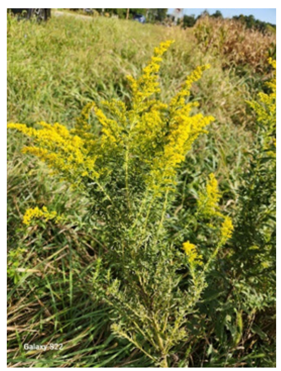
Photo 2: Goldenrod attracts pollinators.

Sureguard have shown good control. Applications can be made in early August to prevent this plant from even starting out. Use of broadleaf weed post emergent materials including 2,4-D have provided adequate control for turf settings, especially when used early in the season when the plant is actively growing and the leaf tissue is soft to aid in chemical uptake. Goldenrod is grown as a cut flower and is used to provide pollinator habitat in the later part of summer.