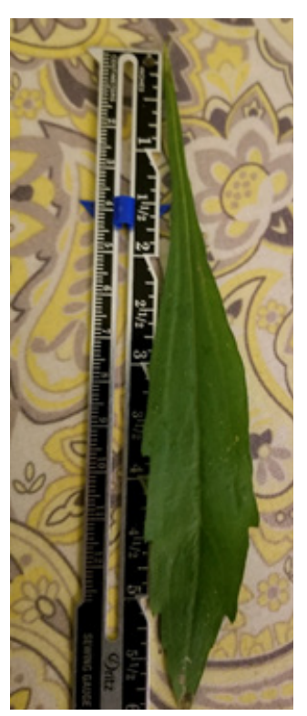
Photo 3: Marestail leaf with widest area near the tip.