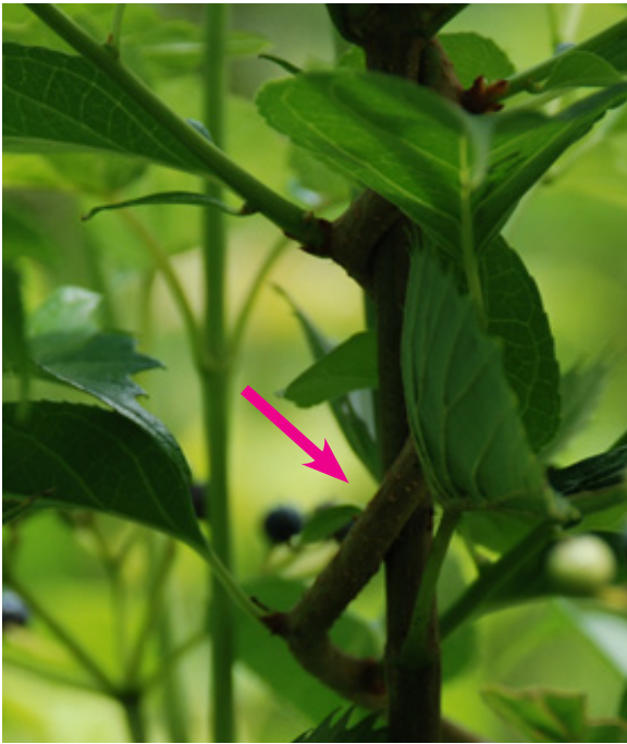
Figure 3. Twining growth habit of Oriental bitterweet.