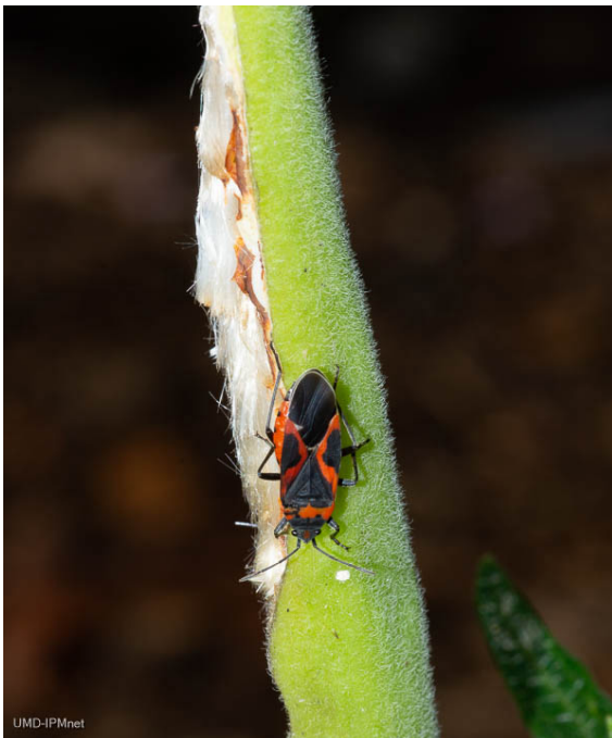
A small milkweed bug adult on Asclepias tuberosa .