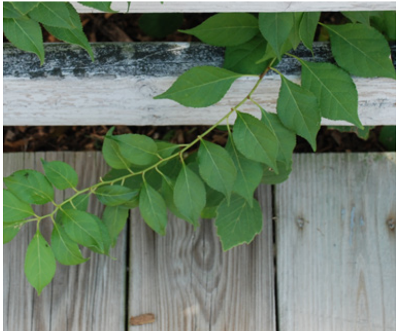
Figure 2. Alternate leaf pattern of Oriental bittersweet.