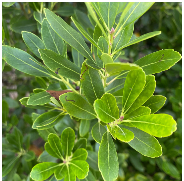
Inkberry leafminer overwinters in the larval stage.

Natalie Bok, Good's Tree and Lawn Care, found active leafminers on inkberries in New Cumberland, PA this week. Leafminers overwinter in the larval stage. If leaves drop prematurely, remove them from the area to reduce the source of a future infestation. Look for pupation and adults next spring. The leafminers are not going to affect health of the plant. If damage is high, you can use a soil drench of dinotefuran in the spring.