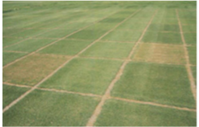
Cultivar evaluation helps to identify disease tolerant and disease prone varieties.

With the arrival of cooler weather this week, it's looking like lawn overseeding and renovation season is under way. The University of Maryland coordinates with Virginia Tech and conducts several trials identifying the top varieties that have performed well in our area. The Maryland-Virginia recommended list ( Publication TT-77 ) has been recently updated and is available on the Maryland Turfgrass Council website ( mdturfCouncil.org ) under the "Maryland Extension Publications and Resources" tab. Utilizing these improved varieties to incorporate during overseeding will help build more stress tolerant lawns.