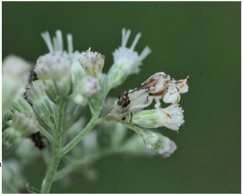
This ambush bug is light in color and camouflages nicely on this light-colored flower head.