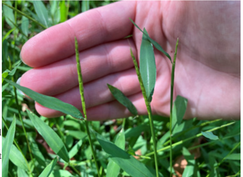
Figure 1. Japanese stiltgrass plants are forming seedheads.

Control of Oriental bittersweet can be accomplished through either mechanical or chemical means. Cutting near the base can be effective with small plants. As plants mature, the use of a stem application after cutting with the immediate use of triclopyr (e.g. Garlon 4) or glyphosate (e.g. Roundup, others). Use caution not to apply the herbicide to the desired plant material, as thin barked species can be damaged or killed. In open settings, where possible apply triclopyr and glyphosate. If possible mow the site first to create the cut stem. Repeated applications may be necessary. The use of a basal oil and a penetrant may be beneficial. Use eye protection when doing stem applications, as some products are salt based and may cause eye damage.