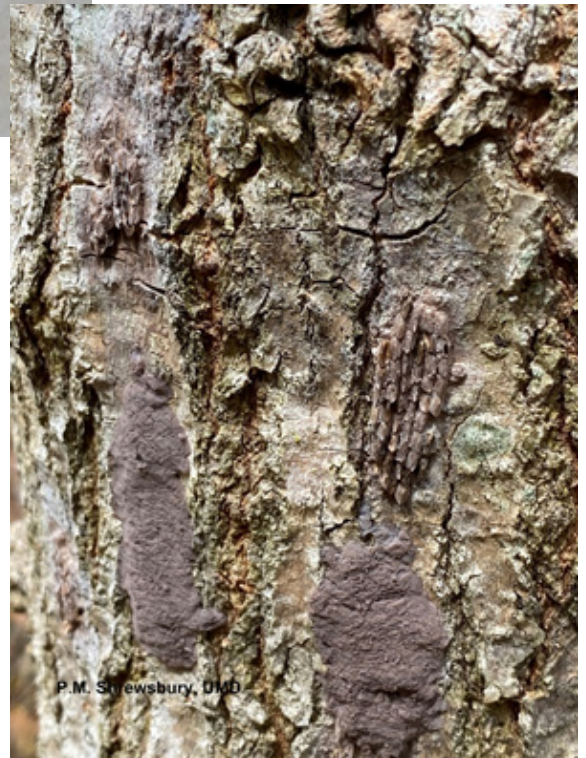
Egg masses of spotted lanternfly laid last November (2023). Note that some are covered with a protective covering of a white-grey putty-like material, while other was not covered and you can see the distinct rows of eggs.