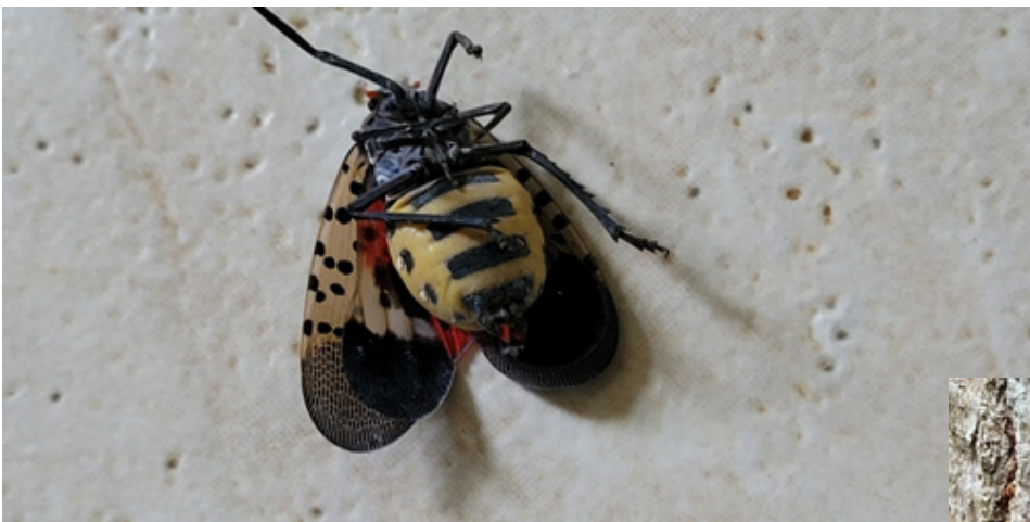
Spotted lanternfly female with her abdomen swollen and full of eggs.

SLF adults are active and abundant in many locations. Adult females are larger than males, with a set of red valvifers at the tip of their abdomen (seen from the underside). Most females have swollen abdomens that are yellow with thick black stripes which indicate they are full of eggs. In the field monitoring SLF this week, most of the females had eggs in their abdomens. I reviewed research that looked at SLF phenology and degree day (DD) associations with particular focus on SLF oviposition. I found that in Pennsylvania, first oviposition occurred around 3,062 DD, and peak oviposition at 3,322 DD. If you look at the report on DD accumulations at the end of this newsletter, it indicates that DD accumulations in the area range from 2,993 DD (Martinsburg WV) to 3,997 DD in St. Mary's City. I would expect that some of you might see new egg masses soon, if not already. Keep your eyes open for the eggs. If you see SLF egg masses , please contact Stanton Gill ( sgill@umd.edu ) and me ( pshrewsbury@umd.edu ) and let us know where and on what host plant / structure you see the egg masses.