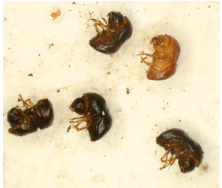
Camphor beetles found in sweet bay in 2018.

John Dwyer, Shreiner Tree Care, pulled a camphor beetle from Japanese maple 'Bloodgood'. This beetle shows up in stressed trees.