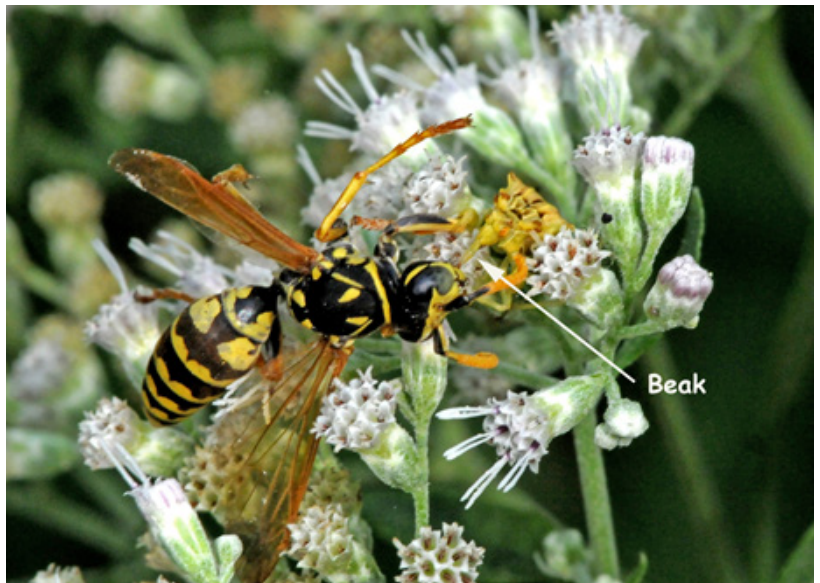
Look very closely and you can see the ambush bug’s sucking beak inserted into the head of the paper wasp ( Polistes dominula ), which has been shown to attack monarch caterpillars, among others, in urban gardens. The unsuspecting wasp landed on the flower to suck up some nectar and ended up with quite a surprise.