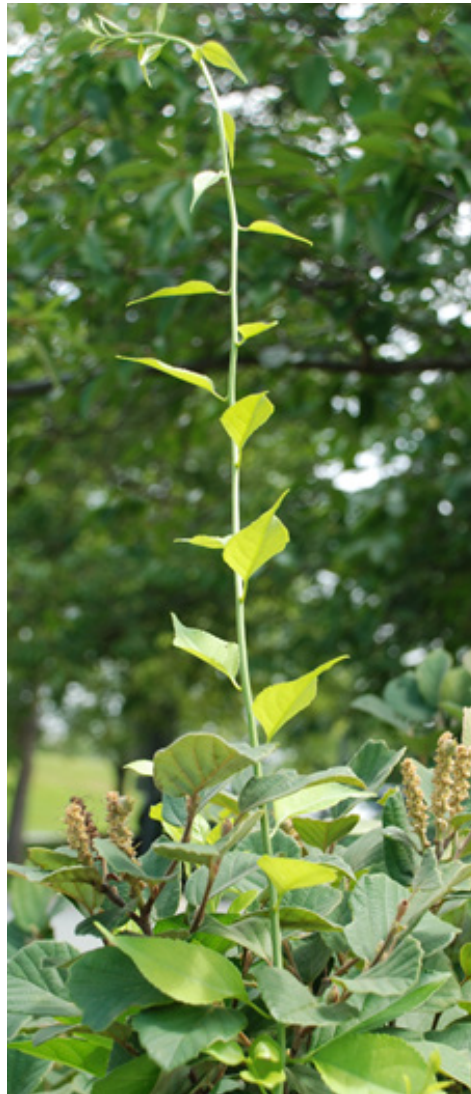
Figure 4. Fast growing upright growth of Oriental bitterweet.