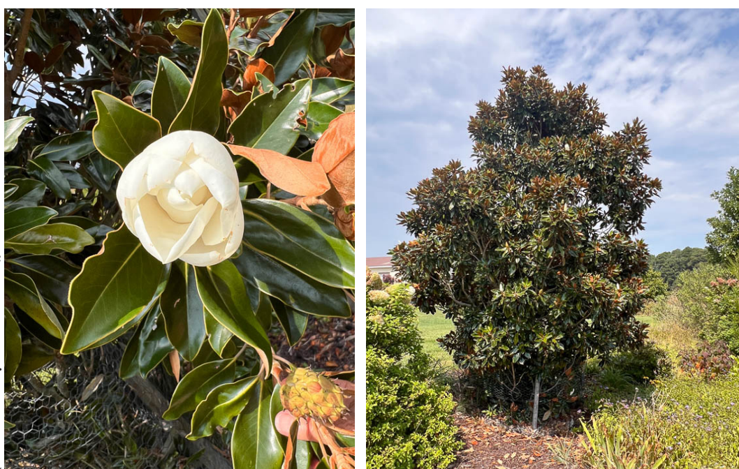
near the ocean and tidal rivers and near roads that get salted Magnolia grandiflora 'Little Gem' in the landscape .

Magnolia grandiflora or southern magnolia can grow 60-80 feet tall and 30 to 50 feet wide, which is often too large a plant for many landscapes. Fortunately, there is a wonderful dwarf cultivar Magnolia grandiflora 'Little Gem' that grows 15-20 feet tall and 8-10 feet wide. 'Little Gem' thrives in full sun to part afternoon shade and prefers to grow in organically rich, moist, well drained soils Like many of the Magnolia grandiflora cultivars, 'Little Gem' is moderately salt tolerant, growing comfortably and near roads that get salted during snowy weather. Plants