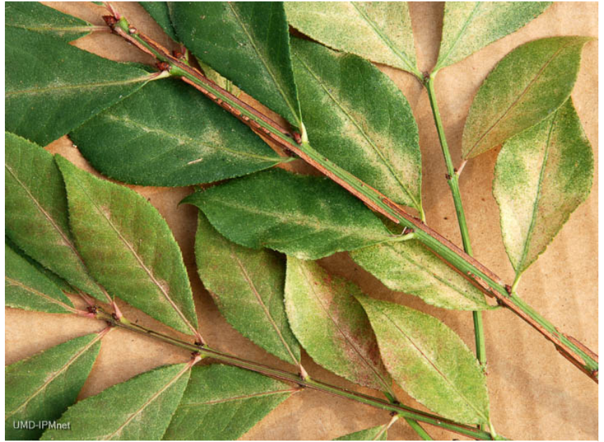
The hot, dry summer has provided ideal conditions for twospotted spider mites to flourish and cause heavy yellow, stippling damage on plants.

The aftermath of this extremely hot summer is going to be felt with many plants dying from extremely dry soils and hot weather conditions. It is very hard to keep plant material adequately watered and treated during these extreme weather periods.