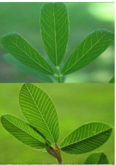
Photo 3: Leaves of sericea lespedeza (top) and annual lespedeza (bottom).