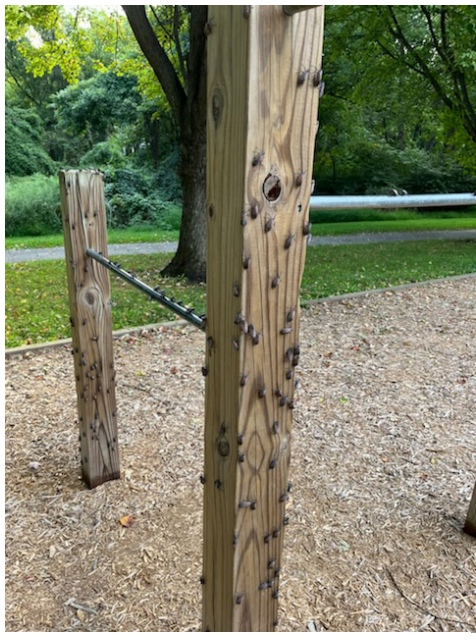
Spotted lanternfly adults covering posts along a Columbia path.

We are looking at the safest materials that your homeowners could potentially use on adult spotted lanternflies to deal with large clusters on lower trunks. Understand soap and oil is merely a contact material and has no residual impact on SLF, but it may provide something your customers could apply safely in home landscapes to knock down large accumulations of adults.