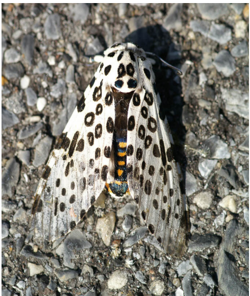
Giant leopard moth ( Hypercompe scribonia ) caterpillar and moth.