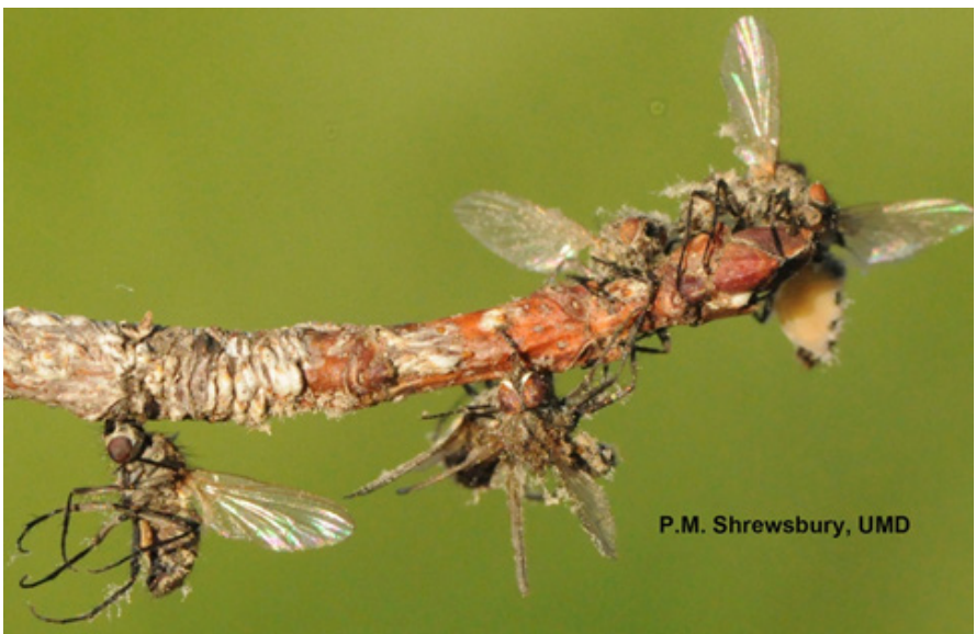
Dead seed corn maggot adults, killed from an insect killing fungi (entomopathogen), on the tip of a maple branch. Ending their life at an elevated point on a plant ensures greater dispersion of the fungal spores. Note the fine fungal mycelium emerging from the flies, and the yellow, discolored abdomens full of fungus.

eggs in organic-rich soils. The eggs hatch and the translucent white larvae, called maggots, search for food. These maggots usually consume decaying organic matter, but when a cool wet spring delays germination and development of crops, seed corn maggots feed on seeds and the roots of seedlings still in the soil thereby creating significant injury. Seed corn maggot has multiple (4-5) generations per year. While a cool wet spring is favorable for larvae, as temperatures warm risk of infection increases for adult seed corn maggot flies. Although not visible to us, there are infective spores of a fungus called Entomophthora muscae on the vegetation of many plants. As the fly lands on vegetation, the tiny fungal spores attach to the surface of its exoskeleton (skin). When just the right temperature and humidity come together, the fungal spores germinate and the fungal hyphae penetrate through the exoskeleton of the fly and establish what will ultimately be a lethal infection. Once inside its host, the fungus penetrates the nervous system of the insect turning it into a fly zombie. Entomopthora manipulates the fly's behavior in several ways - all which benefit the survival and spread of the fungus. Research conducted on a related species of fly, the house fly, found that infected female flies became highly attractive to males. In the process of male flies "hooking up" with these infected females, spores on the