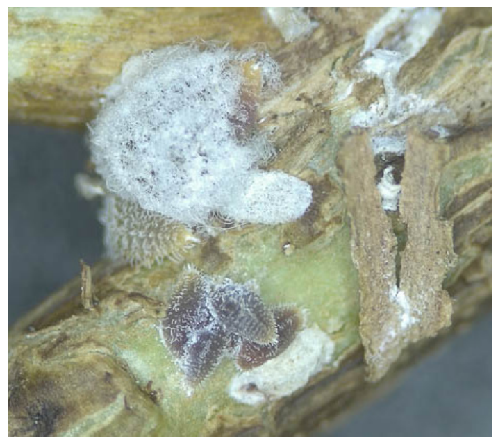
Crapemyrtle bark scale cover removed to show stages present at this time on plants at the research center.

Finally, we have a newly established crapemyrtle bark scale population on some of our trees at the research center in Ellicott City. There are many later instars as well as earlier, recently settled stages. In the vicinity, there are also many lady beetles and other predatory insects, so we will keep an eye out for their activities involving the CMBS. As of now, there are ants feeding on this population's honeydew and lacewing eggs found on nearby leaves of the same tree. These interactions could potentially give us some kind of a foresight as to how CMBS may end up interacting with Maryland's environment.