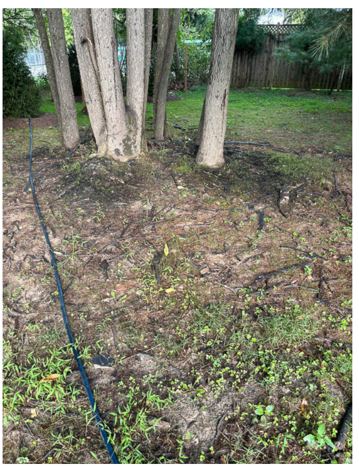
A lot of sooty mold is growing on the honeydew from SLF that has dripped onto the ground.