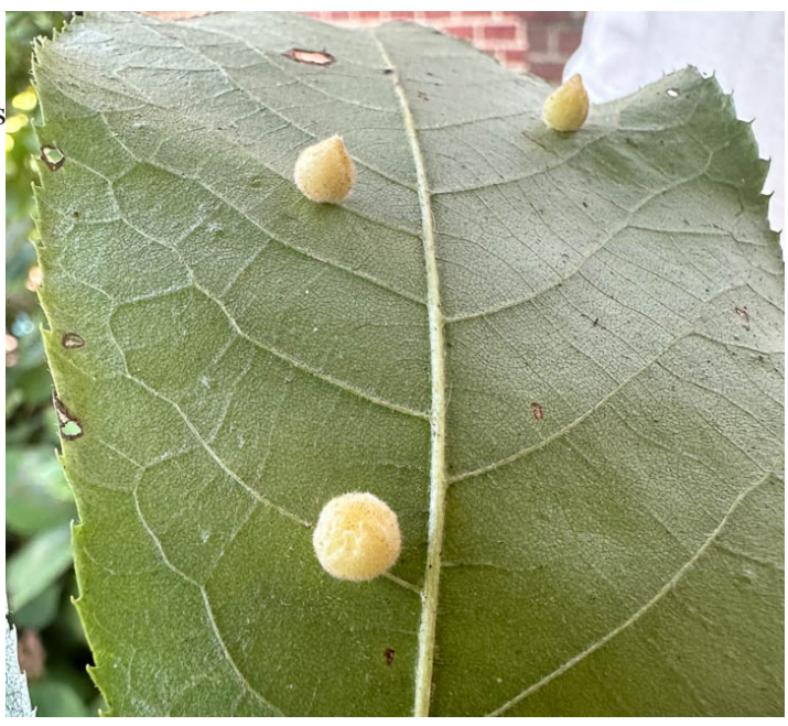
These hickory peach-haired galls are caused by midges.

Dave Freeman, Oaktree Property Care, found hickory peach-haired galls that are caused by midges. The gall midges drop to the soil to pupate. In the spring, the adults emerge from the soil and lay eggs on the developing hickory buds. These galls do not impact the overhall health of the tree, so control is not necessary.