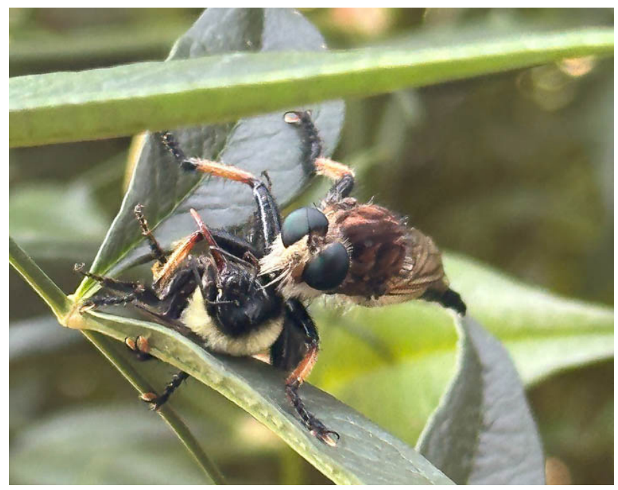
A robber fly is feeding on a bumble bee.