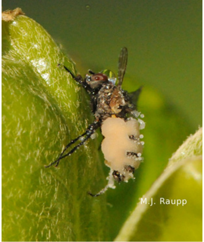
A dead seed corn maggot showing signs of infection by the fungal pathogen, Entomophthora muscae .