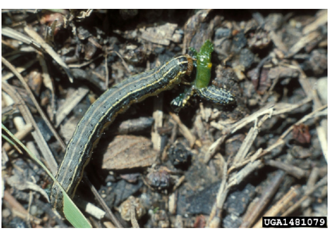
Fall armyworm caterpillar.

Back in 2020 and 2021, we had a major outbreak of fall armyworms in lawns. Fall armyworm is a native pest to North America. The weather has been perfect for it to flourish in August. The fall armyworm (FAW, Spodoptera frugiperda ) is a destructive pest that can feed on 80 different crop species, including corn and more importantly to the horticulture industry, turf. It clearly prefers