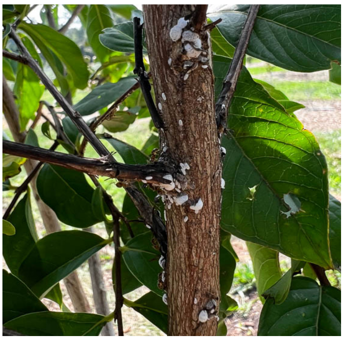
The current crapemyrtle bark scale population on one of the plants here at the research center.