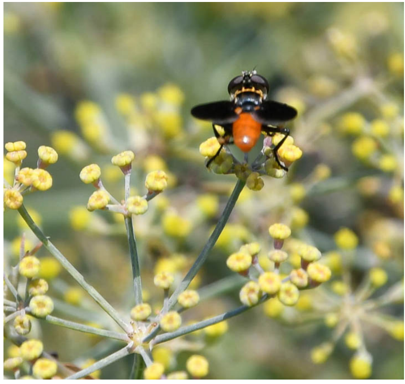
Adult feather-legged flies feed on nectar.

Dave Freeman, Oaktree Property Care, found this feather-legged fly, Trichopoda pennipes , this week. This tachinid fly is another generalist predator. Its main prey are squash bugs and southern green stink bugs. Female adults lay small white to gray eggs on the stink bug or squash bug. This fly overwinters in the larval stage in its overwintering host.