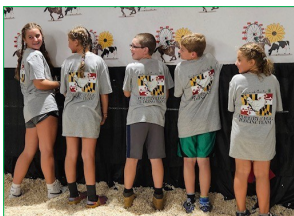
This year the team had shirts made up representing our Frederick County Poultry & Egg Judging