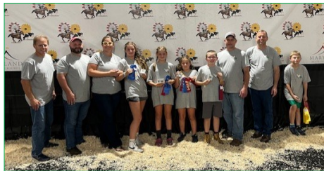
The gang consisting of 4-Hers and parents wearing their new shirts after the awards ceremony.