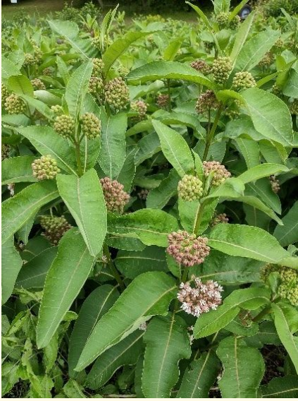
Common Milkweed colony that is already attracting bees and at least one monarch