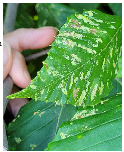
Eriophyid mites cause erineum patch on beech.