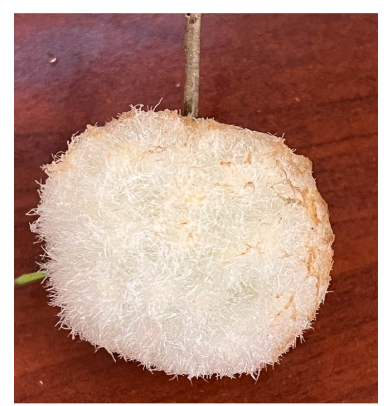
A wool sower gall cut open to show the inside of the gall.