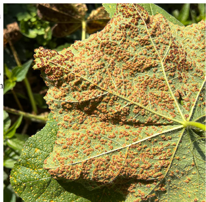
This photo shows a rust infection on the upper and lower leaves of hollyhock.