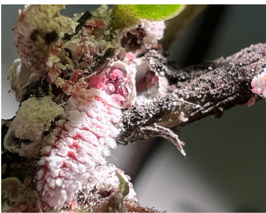
Crapemyrtle bark scale eggs are hatching and being fed upon by Hyperaspis lady beetle larvae.

I saw this gathering of Hyperaspis larva week on a property in Baltimore City. The individual had scrubbed the portion