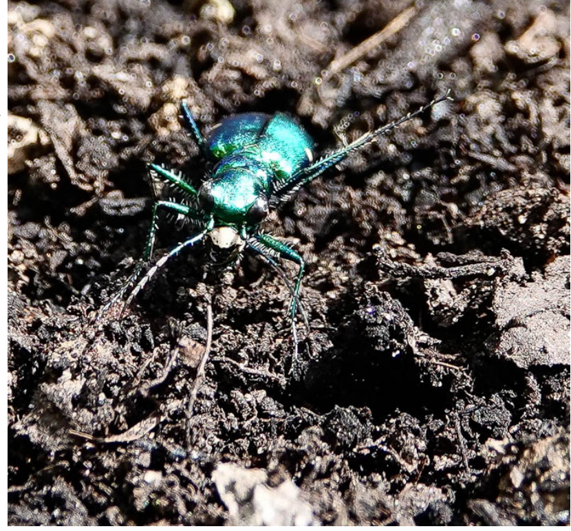
Six-spotted green tiger beetle adults are very fast fliers.

Nancy Woods found a female six-spotted green tiger beetle, Cicindela sexgutatta , that was laying eggs. The tiger beetle is a predator as a larva and an adult. It is a very fast flier as it goes after prey. The larva hangs out in a burrow and then reaches out and grabs prey as it goes by. These beetles are often found along open, wooded pathways.