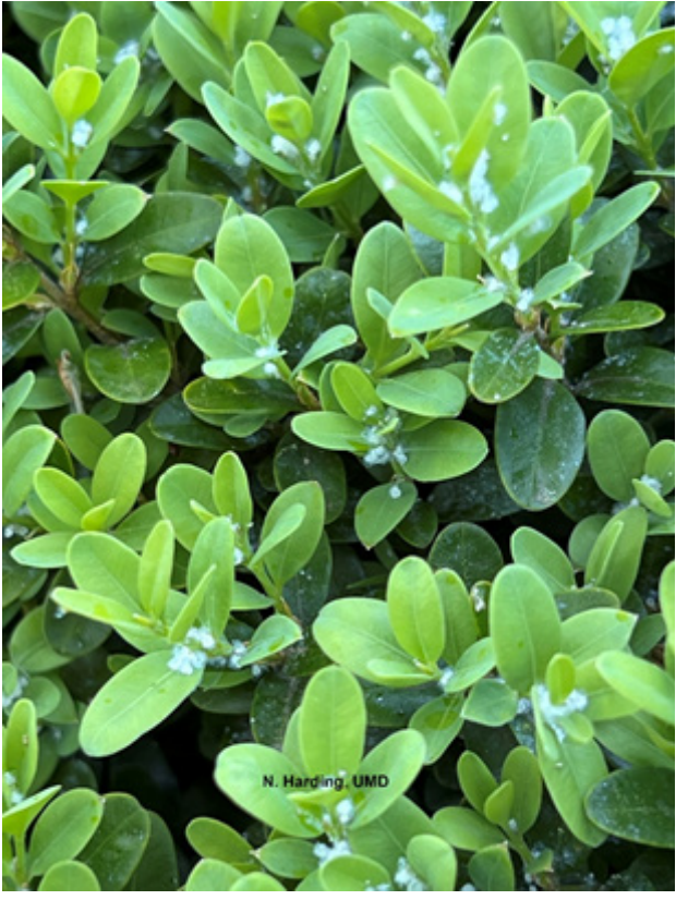
Wax from psyllids on boxwood. Predatory syrphid larvae were found in the new growth where psyllids were feeding.