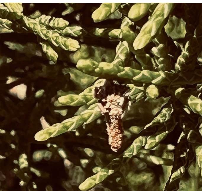
Check trees for bagworm egg hatch. It is most effective to treat larvae when small.