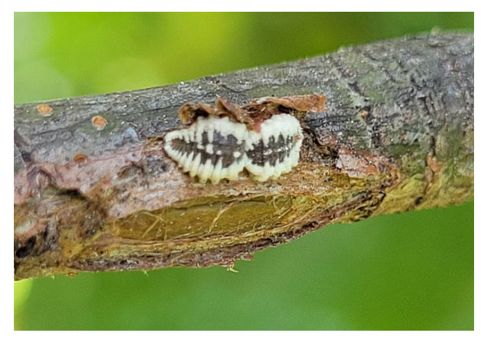
European elm scale has an extended crawler period during the summer.

Control: Look for beneficial insects which can do a good job controlling this scale. If an insecticide application is necessary, treat with a soil drench of dinotefuran (Safari, Transtect) or make foliar applications of Distance or Talus.