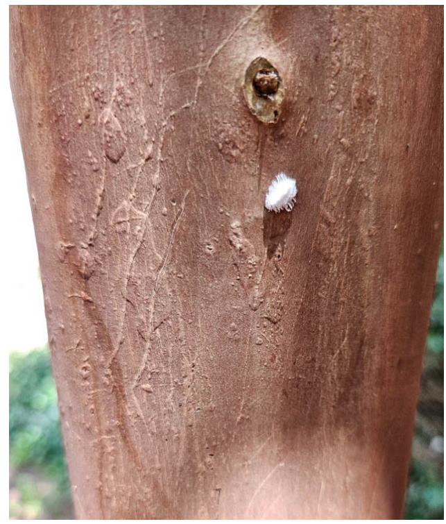
Hyperaspis lady beetle larvae are feeding heavily on a population of crapemyrtle bark scale.