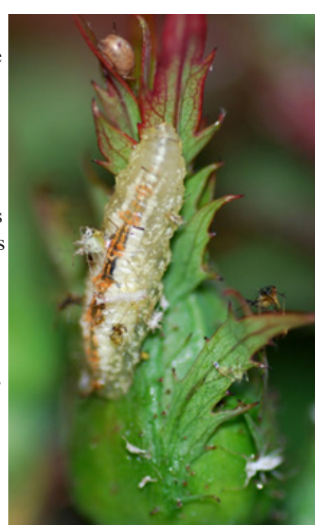
Syrphid fly larvae are voracious generalist predators that feed on psyllids, aphids, mites, and other small insects.

There are several generations of syrphids a year. Life stages include the egg stage, 3 larval instars, pupa, and adults. Syrphid fly adults are not predacious, they only feed on nectar and pollen and are considered important pollinators for some plants. In fact, they require floral resources to obtain the nutrients they need to make eggs and produce young. The larval stage of syrphid flies is the predacious stage and they are generalists feeding on a diversity of soft-bodied insects. Syrphid fly adult females cue in on branches infested with potential food for their larvae. The female will lay small white eggs individually on the leaves or buds of these infested plants. Once the eggs hatch, the legless maggot-like larva search for and voraciously consume prey items. Larvae vary in size (4-18 mm) and color patterns (yellow, pink, green, or brown with yellow or white markings) depending on life stage and species. The body tapers at one end and it is this "pointed" end that is the head end