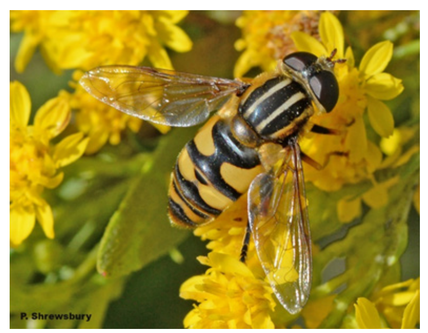
Syrphid flies feed on nectar and pollen when they are adults. Note the diagnostic one pair of wings, large eyes, and short antennae on this true fly that mimics bees.

that help to suppress many small soft-bodied insects such as psyllids, aphids, spider mites, thrips, small caterpillars and other prey. If you have plants infested with aphids, within a short time period you will have syrphid fly larvae snacking on the aphids. A single syrphid larva can consume about 400 aphids in its lifetime. Since adults feed on nectar and pollen be sure to provide flowering plants to attract and support syrphids and other omnivorous natural enemies.