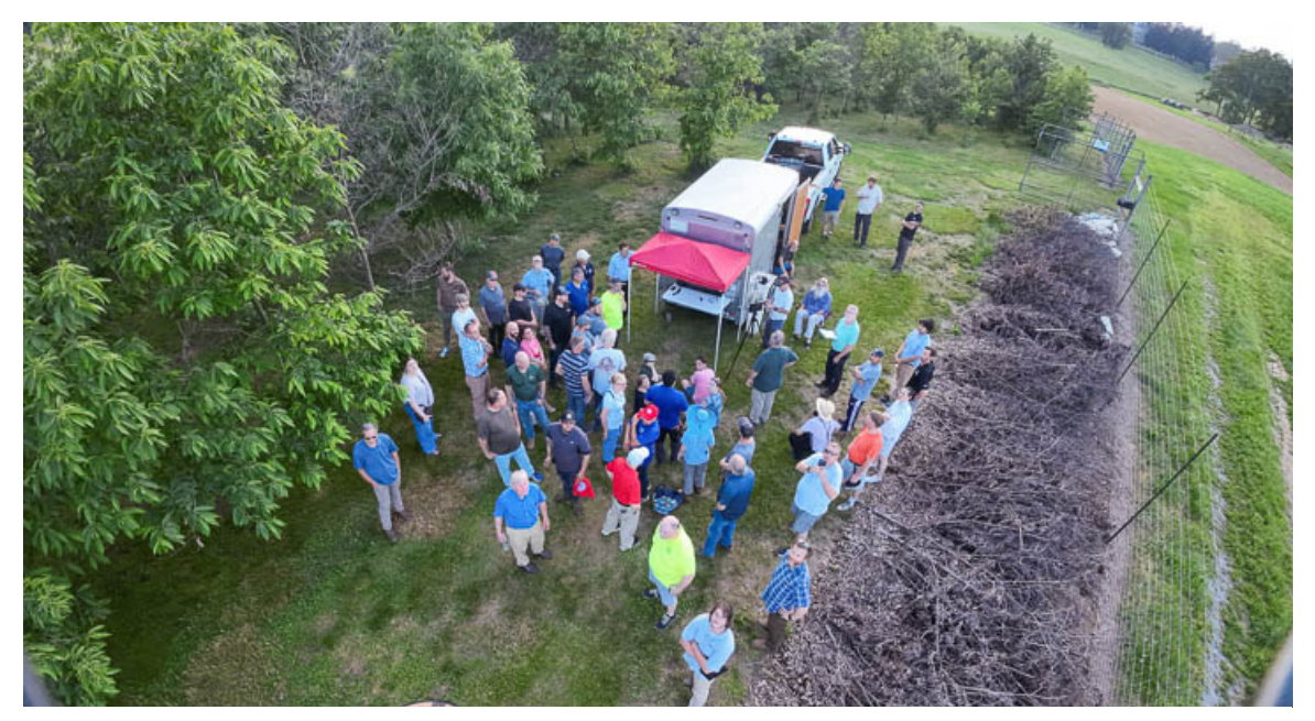
'Drone's eye view' of the tour group during the IPM program.

There were about 60 people who attended the Maryland Arborists' Association (MAA) and UME Diagnostic session on May 22 here at the Central Maryland Research and Education Center in Ellicott City. There were powerpoints and a drone demo during the program. MAA and UME will a follow-up session on June 27 from 5 p.m. to dark at Carroll Community College in Westminster.