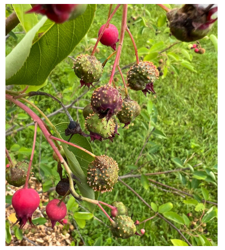
Gymonsporangium rust infections are still active.