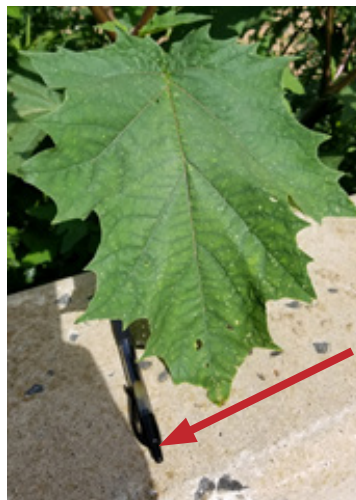
2. Note writing pen for scope of size of a jimsonweed leaf

Jimsonweed, Datura stramonium , is showing itself in many areas currently. It seems to be thriving in the warm temperatures. Primarily a weed found in pastures or agronomic crops, it can be found in turf and landscape settings. Jimsonweed is a summer annual. It has a distinctive odor, purple flower, and a deep-branched taproot. The odor is unpleasant to most and will be more notable when touched. The leaves are three to eight inches in length and up to six inches in width (photo 2). The leaves do not have hairs and are attached by way of a one to two inch strong petiole. Leaves are toothed and a green to maroon color (photos 2 and 3). Purple flowers (photo 1) produce a seed pod that has thick, stiff thorns. The pod will divide into four segments at maturity. Stems of jimsonweed are thick and hollow. Care should be taken with this plant, as it is poisonous. Even skin exposed to the fluid from the plant when using string trimmers have made some people ill.