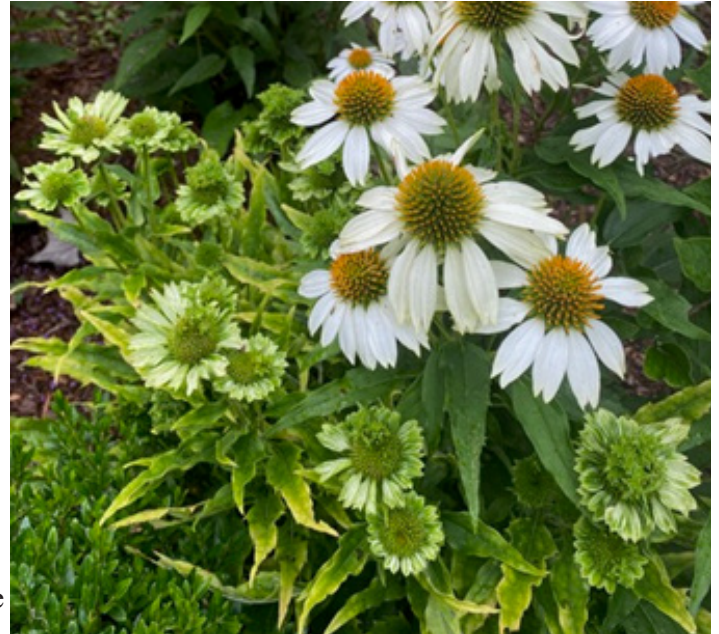
Figure 1. Echinacea cv. Pow Wow White with stunted, greenish flowers symptomatic of aster yellows disease. Normal flowers are in the upper right section of the photo.

Because the infection is systemic throughout an infected plant, plants are not "cured" by removing symptomatic flowers – the entire infected plant should be removed to reduce the amount of inoculum in the planting. Remove weed hosts, such as wild carrot, field daisy, dandelion, and thistle that can harbor the pathogen. More information on aster yellows can be found at this link from the Missouri Botanical Garden .