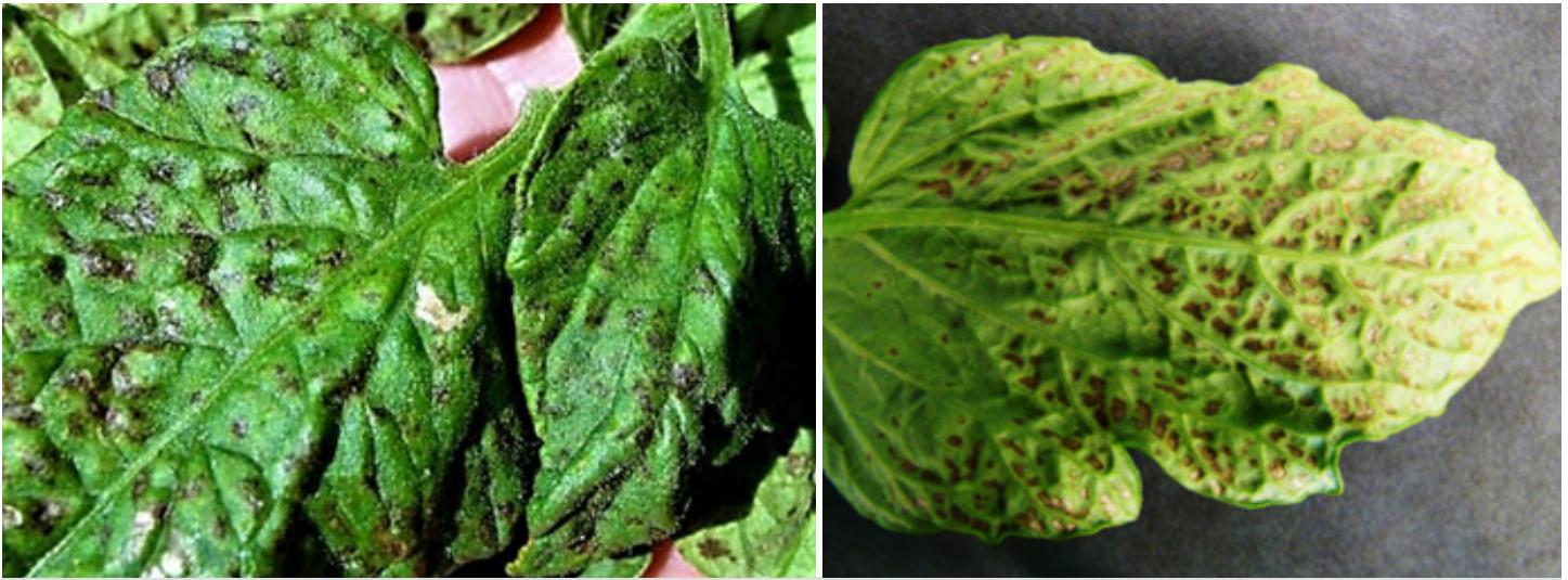
Fig. 3 Ozone damage to tomato leaves