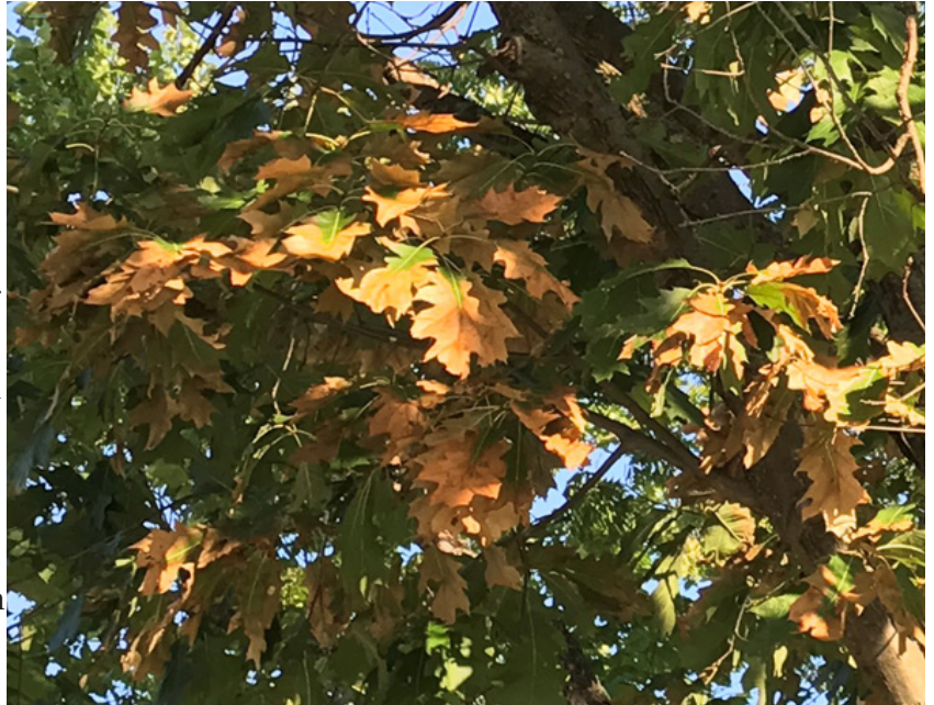
Fig. 1: Bacterial leaf scorch symptoms on red oak

Symptoms of bacterial leaf scorch (BLS), caused by the bacterial pathogen Xylella fastidiosa , are likely to develop in the next few weeks on shade trees in our region. X. fastidiosa is vectored by a variety of xylem-feeding insects including sharpshooters, treehoppers, and spittlebugs. Symptoms develop on foliage as browning margins (“leaf scorch”) (Figure 1), often with a dark brown or yellow “halo” between the green and brown tissue. Hosts include elm, oak, sycamore, maple, ginkgo, and sweetgum. Systemic spread in addition to repeated infection in subsequent years can result in significant branch dieback and tree decline, particularly in trees with site stress issues.