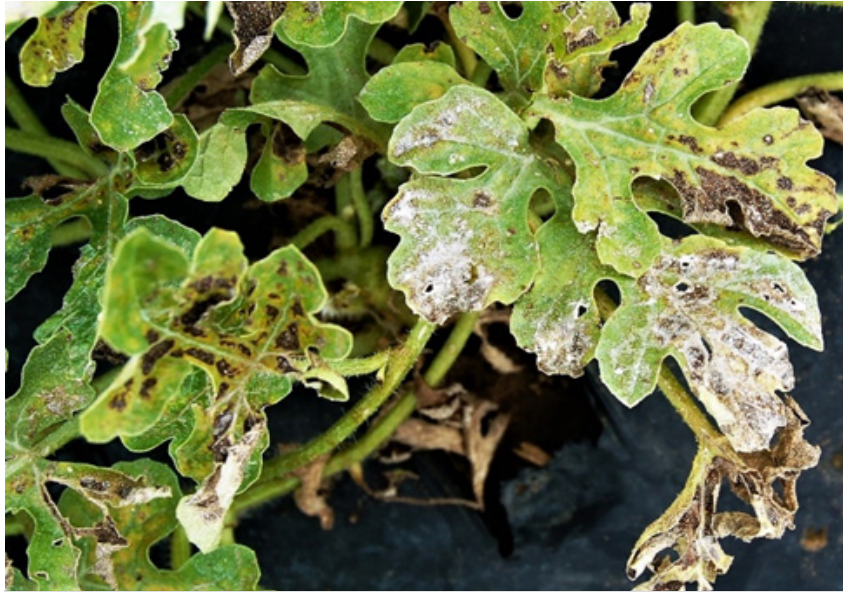
Fig. 1 Ozone damage to watermelon crown leaves

Trying to estimate yield loss due to air pollutants in the field is difficult and only approximations can be made. In a California study, ozone damage to crops caused the greatest yield losses (10-30%) in watermelon, cantaloupe, grape, onion, and bean. Other research has shown that when average daily ozone concentrations are moderate to high, yields of vegetables can be reduced by 5-15%.