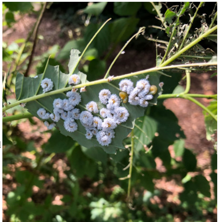
In this instar, dogwood sawflies resemble bird droppings which helps protect them from predators

Control: The sawflies have done most of their damage for the year. Next year, scout for this sawfly and control early with materials such as Conserve and synthetic pyrethroids.