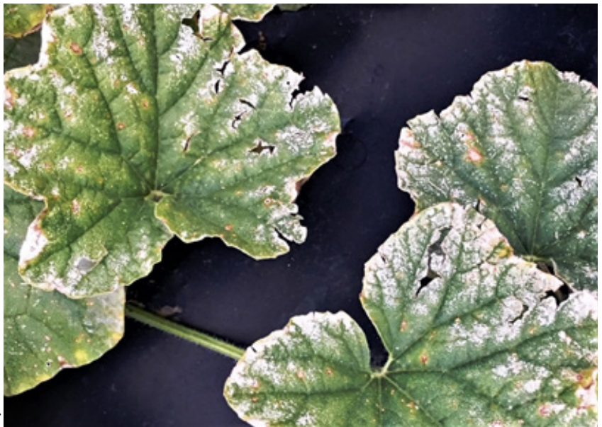
Fig. 2 Ozone damage to cantaloupe leaves