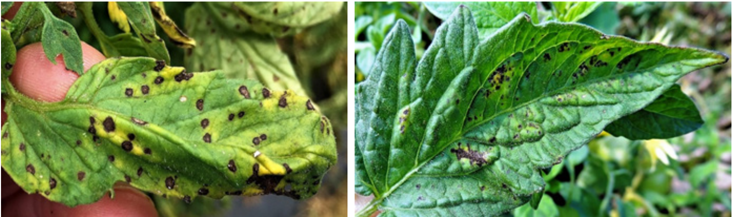
Fig. 4 Bacterial spot on tomato leaves