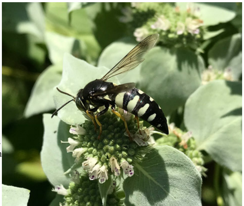
This wasp, Bicyrtes quadrifasciatus, is a predator of stink bugs

Several years ago, we set up a program with Cavano’s Perennials to attract beneficial insects. Mountain mint was an excellent long season flowering plant that pulled in many beneficial wasps including this one. I planted a large plot of mountain mint in my orchard to attract beneficials, and it has been very active with predator activity over the last week or two and will continue into September. We need to take advantage of all the good guys we can get.