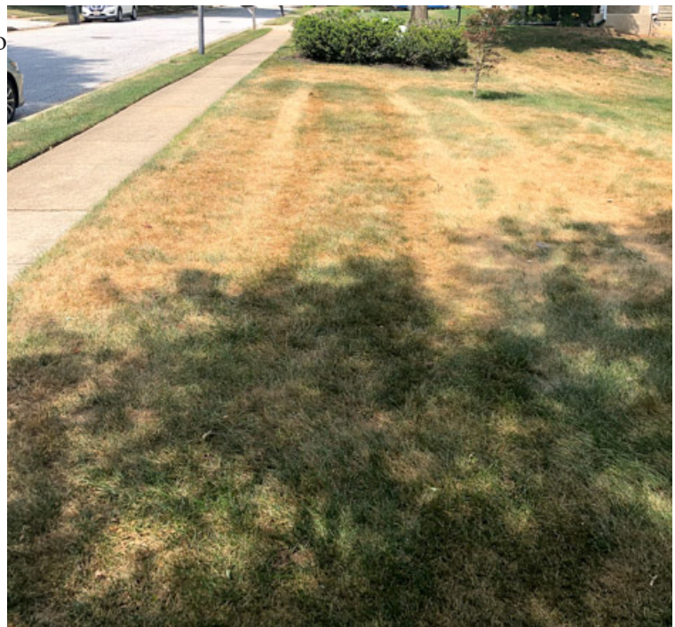
This fine fescue lawn turned brown after being mowed when temperatures reached 95 °F

Mark Schlossberg, ProLawn Plus, Inc., sent in a photo showing what happens when fine fescue is mowed in 95 °F temperatures.