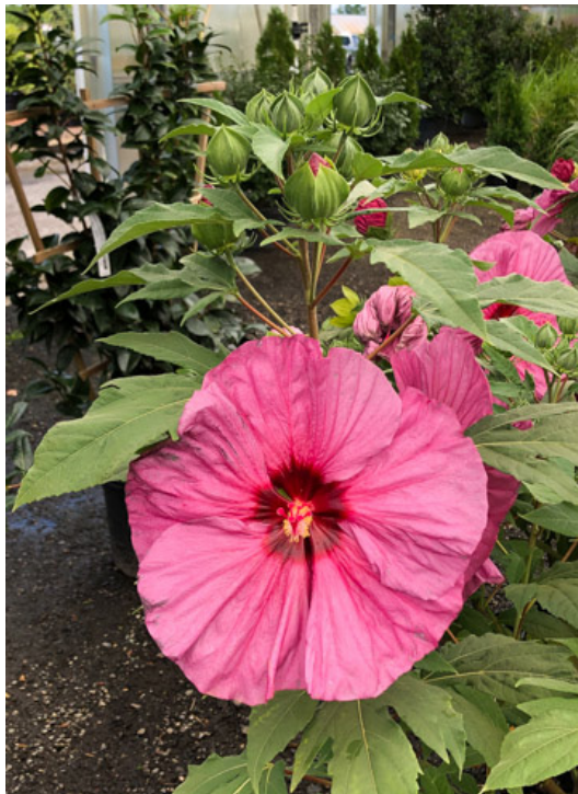
Hibiscus 'Berry Awesome' flowers can be up to 9 inches across