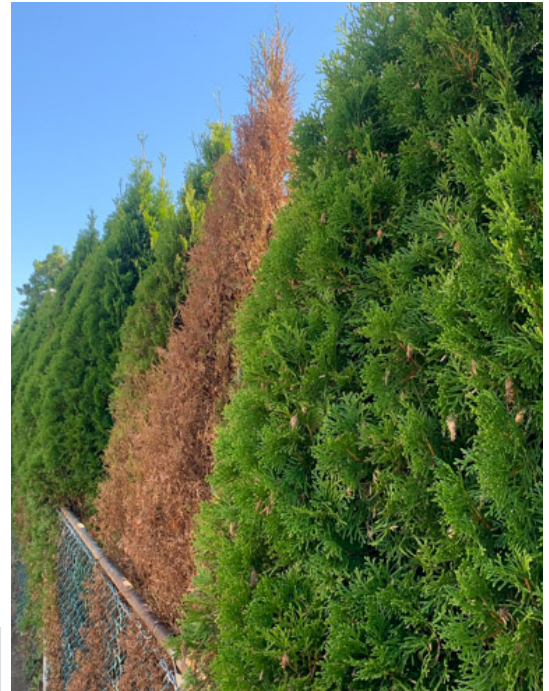
Bagworms have damaged these arborvitae in Baltimore

Control: Options include spinosad (Conserve), Acelepryn, Mainspring, Orthene, and Astro. In light infestations, hand picking off bags is an option.