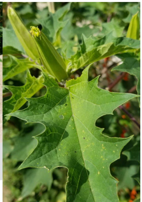
3. Jimsonweed leaves are green to maroon