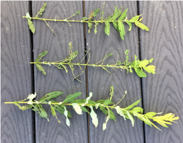
Japanese beetles have been feeding along the stems of dappled willow, but not on the tips

Debby Smith-Fiola, Landscape IPM Enterprises, found Japanese beetles feeding on Japanese dappled willow. Debby noted that the willows were already stunted because of the late frost damage, and now attacked by Japanese beetles. She reported there was skeletonization/defoliation by the adults (avoiding the newest growth).