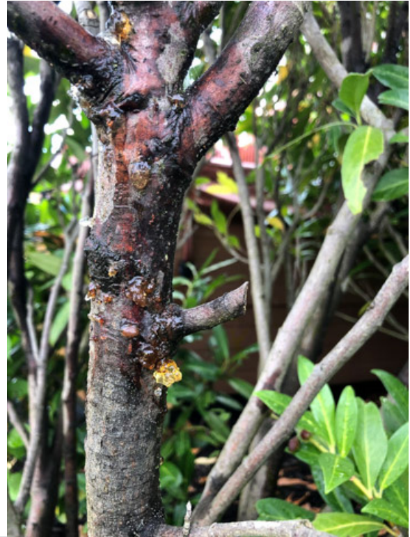
This skip laurel has been severely damaged by peachtree borers and white prunicola scale