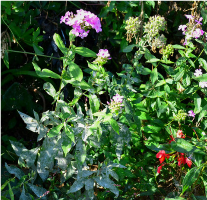
Powdery mildew can be a problem on phlox

View the full report at: https://1x848d9mftq5g9wx3epiqa1d-wpengine.netdna-ssl.com/wp-content/uploads/2017/12/MtCuba-Phlox-Report.pdf