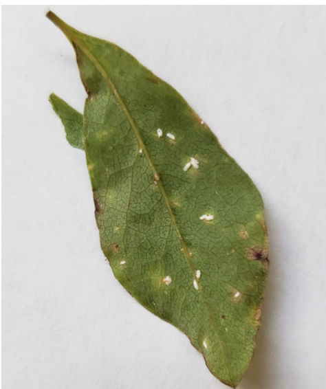
The armored scale, Chionaspis nyssae , infests black gum

Marie Rojas, IPM Scout, sent an interesting armored scale into our lab. It was an armored scale on Nyssa sylvatica , commonly called black gum or sweet gum. The scale is named Chionaspis nyssae . It turns out that this tree has many common names. Some people call it black tupelo, but is also known in various areas as a gum tree, sour gum, bowl gum, yellow gum or tupelo gum. Still others call it beetlebung, stinkwood, wild peartree, or pepperidge. Whatever you want to call it, Nyssa sylvatica is susceptible to this armored scale. The concern is this native tree is getting more and more popular in the nursery trade. We need you to examine your trees closely for this armored scale and try to prevent it from spreading around into the landscape. It is a foliage feeder so materials such as Dinotefuran or Altus should work well.