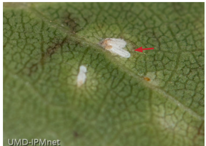
A pair of the armored scale, Chionaspis nyssae , is shown clustered together with the male on top and the female below