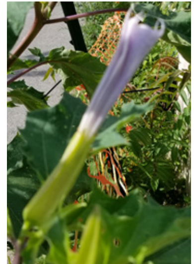
1. Jimsonweed produces a large purple flower

Jimsonweed, Datura stramonium , is showing itself in many areas currently. It seems to be thriving in the warm temperatures. Primarily a weed found in pastures or agronomic crops, it can be found in turf and landscape settings. Jimsonweed is a summer annual. It has a distinctive odor, purple flower, and a deep-branched taproot. The odor is unpleasant to most and will be more notable when touched. The leaves are three to eight inches in length and up to six inches in width (photo 2). The leaves do not have hairs and are attached by way of a one to two inch strong petiole. Leaves are toothed and a green to maroon color (photos 2 and 3). Purple flowers (photo 1) produce a seed pod that has thick, stiff thorns. The pod will divide into four segments at maturity. Stems of jimsonweed are thick and hollow. Care should be taken with this plant, as it is poisonous. Even skin exposed to the fluid from the plant when using string trimmers have made some people ill.