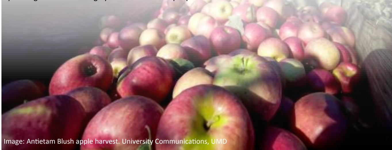
Image: Antietam Blush apple harvest.