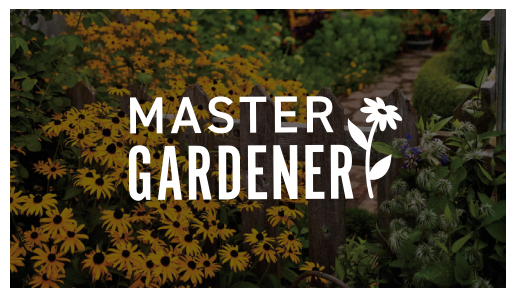
✓ Using a 60% black overlay, there is enough contrast between the image and logo.