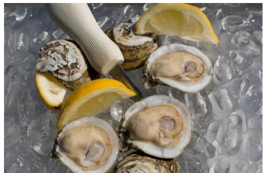
Aquaculture growers produce high quality shellfish

If you wish to process shellfish either by shucking or other removal techniques, the facility where you process the product must be inspected and permitted by the DHMH. To operate as a new food processing plant, a written plan is required. When it has been approved, an inspection will be conducted. Upon approval, you will receive and complete a license application. Existing food processing facilities must comply with Maryland health regulations.