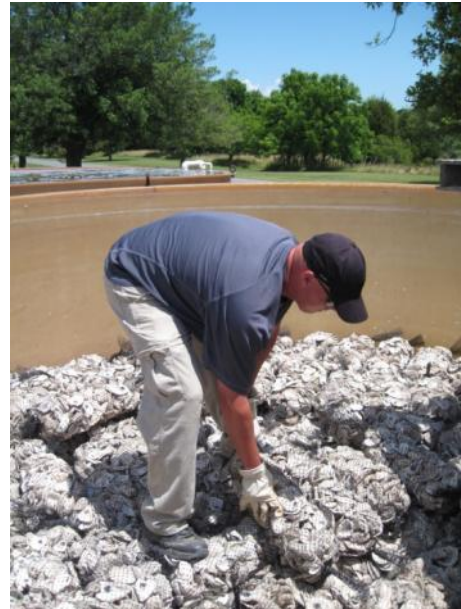
Plastic mesh shell bags provide one means of containing shell for setting

Products: non-toxic antifouling coatings for aquaculture and commercial fishing applications