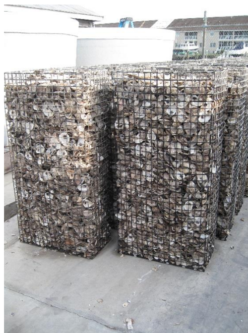
Vinyl coated wire cages have been developed as an alternative to shell bags.

Products: commercial fishing supplies; personal protection gear; knives