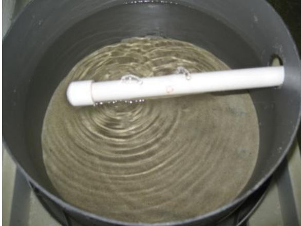
Downweller with microcultch provides production for "cultchless" oyster seed for single oysters

Tarkill Aquaculture Ventures, LLC OY, Contact: Bob Boardman PO Box 94 Onancock, VA 23417 757-894-2009 www.tarkillaquacultureventures.com