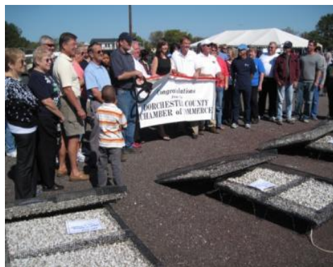
Shellfish aquaculture businesses build economic growth in our rural communities

Regional offices are available throughout the state with staff who can meet with you one-on-one to help your business grow.