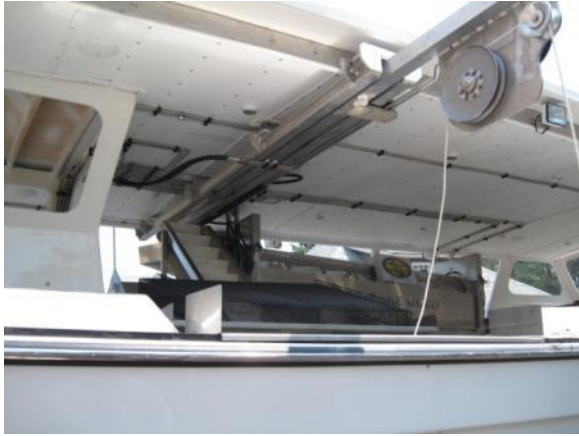
Hooper's Island Oyster Company specialized aquaculture vessel fabrication services