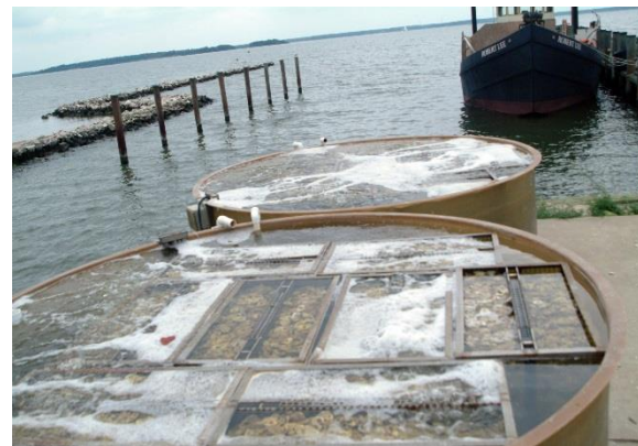
Remote setting systems for seed production require pumps and aeration for proper operation.

Products: commercial fishing supplies; personal protection gear