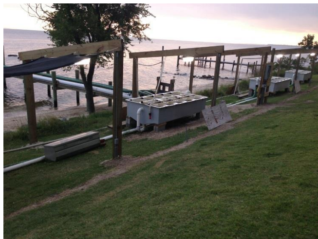
38° North LLC oyster nursery on the Potomac River