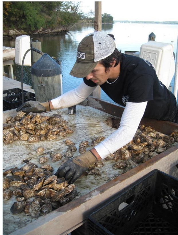
Oysters are graded and packed for distribution to buyers