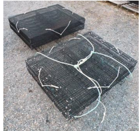
Bottom cages hold shellfish to provide protection and come in a variety of sizes.

Contact: D.O. Baker Broomes Island, MD 20615 410-591-0361 Products: oyster cages, long line spat cages