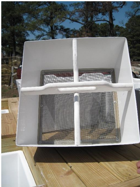
Silo boxes fit in a floating upweller (FLUPSY) to hold seed while it grows

Bagwell Enterprises HC Contact: Yvonne Bagwell Smith Beach Road P.O. Box 508 Eastville, VA 23347 757-678-5806 757-678-7329 (fax) clammom@gmail.com