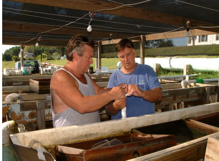
MIPS helped Gordon's Shellfish LLC develop a shellfish nursery

Staff members suggest that you contact them for a meeting before developing your proposal so that they can become familiar with your company and the needs of the project. They will be able to advise you on how to plan and write your proposal as well as assist you in submitting the application and identify high quality researchers to carry out the project.