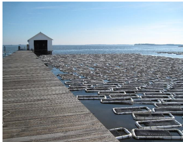
Floats can be used to culture oysters on the surface with the shellfish placed in bags in the flotation collars.

Products: aquaculture growout equipment and supplies; pipe & accessories