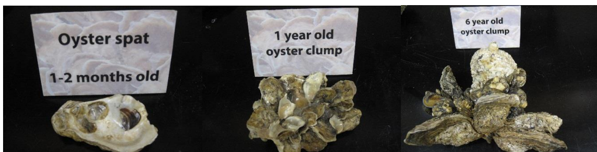
Oyster growth from 1-2 months through the first year and to the year 6