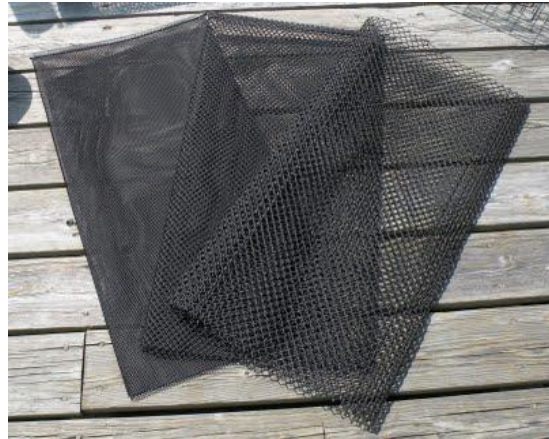
Plastic mesh oyster bags come in a variety of sizes. Oysters are transferred to larger sizes as they grow.

Products: wire, oyster cages, oyster bags, floats; tools; grader/sorter; conveyors, upwellers