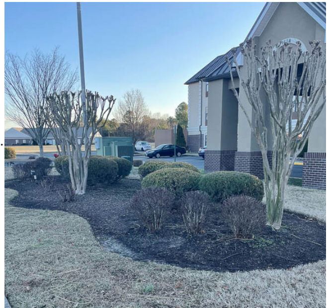
"Florida-style" pruning of crape myrtles