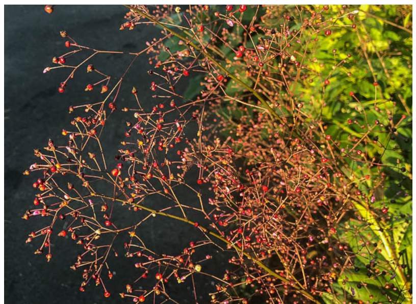
Close-up of Talinum paniculatum fruit

This plant would work well as filler in a mixed bouquet.