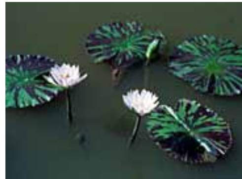
Tropical Water Lilly

Tropical cultivars begin blooming when the weather becomes hot, about mid-June, and continue to bloom steadily until they are killed by the frost in late fall. Do not place them into your pond if the water temperature is at or below 70° F. If too cold, the plant will become dormant for 6–8 weeks, which greatly reduces the growing and flowering period of the plant. The colors of tropical lilies include deep red, yellow, pink, white, and blue. Their blossom size is much larger than the hardy types, ranging in size from 2" inches to 8" inches or more across. As an interesting comparison, the tropical flowers generally bloom 6–12" above the surface of the water while the hardy water lily flowers float