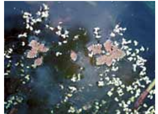
Azolla and Duckweed