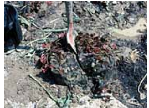
Dividing & planting

When working with aquatic plants keep the roots moist and protected from the sun. The foliage of water lily is very sensitive to drying out and should be kept moist during all stages of planting. When planting water lilies and other aquatic plants, be careful not to bury the growing point, or rhizome, too deep in the potting soil. This usually leads to