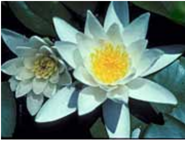
Hardy Water Lilly