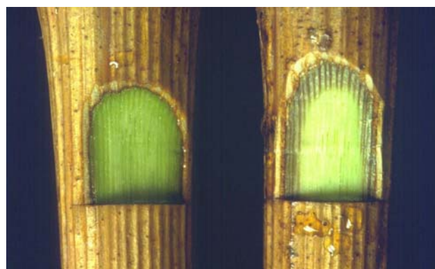
Figure 3. Damage to tissue inside cane

http://shop.msu.edu/product_p/bulletin-e2930.htm