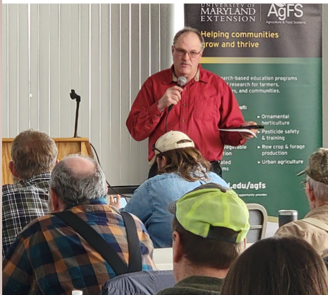
HAY & PASTURE CONFERENCE

Recently Maryland-Delaware Forage Council partnered with University of Maryland Extension to deliver local farmers the Annual Hay & Pasture Conference. University of Maryland Extension hosted the Western Maryland Agronomy Meeting. These workshops provided an overview regarding pesticide record keeping and storage, personal protection, native warm-season grasses, pasture systems for smaller farms, timothy as an annual forage to name just a few topics. Farmers were able to obtain Private Applicator Pesticide and Nutrient Applicator Vouchers and Consultant recertification credits for attending.