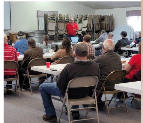
WESTERN MD AGRONOMY MEETING