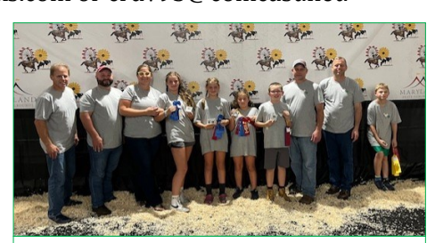
The gang consisting of 4-Hers and parents wearing their new shirts after the awards ceremony.