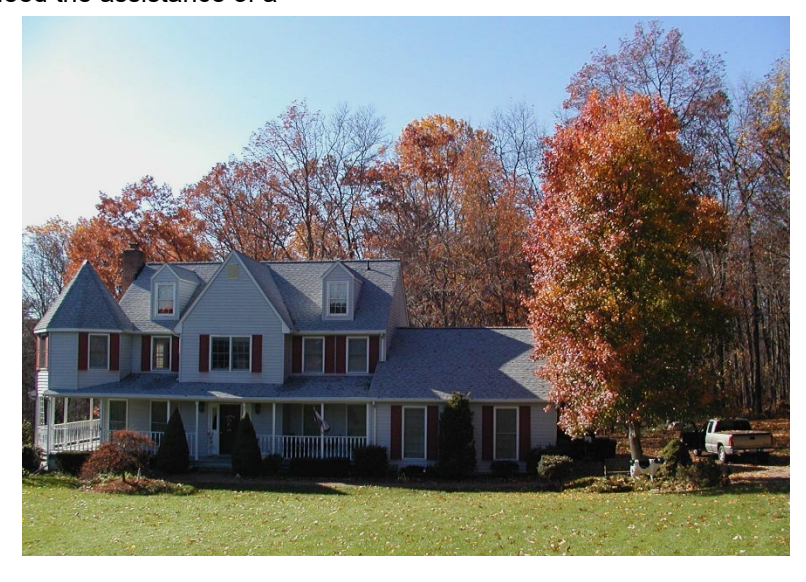
Owners of small-acreage lots with woodlands can benefit from professional assistance in managing their property.

Foresters with at least a Bachelor of Science degree and two years of practical experience under the quidance of a licensed forester. Foresters on this list are Licensed Professional Foresters with the State of Maryland's Board of Foresters within the Department of Labor, Licensing and Regulation