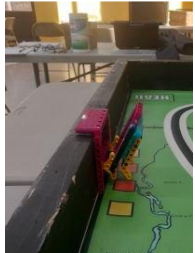
Bird feeder in the closed position