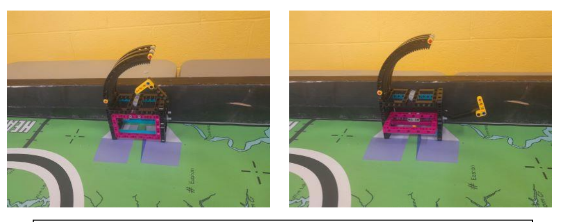
The left picture above shows the blind in the closed position and the picture at right shows the blind in the open position.