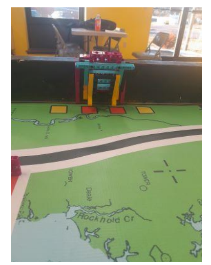
Bird feeder location

Score: 5 points per food piece completely in feeder, 3 points per piece in base (Max 30 points)