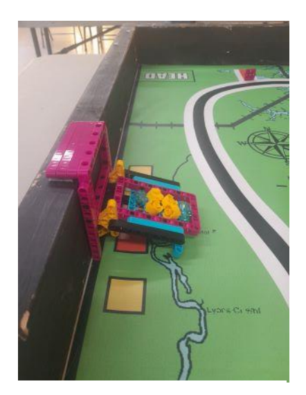
Bird feeder in the open position with the birdfeed inside the feeder