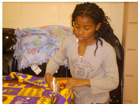
PAL Center 4-H Member working on 4-H Project.

PLEASE NOTE: 990-N filing will fail for many eligible, qualified 4-H subsidiaries. Some reasons may include the organization is not on file with the IRS under GEN 2704 or errors in their EIN record. For eligible/qualified subsidiaries: "It is better to try & fail, than to fail to file IRS tax forms." Whether successful or not in filing a 990-N, 4-H subsidiaries need to save evidence of success or failure.