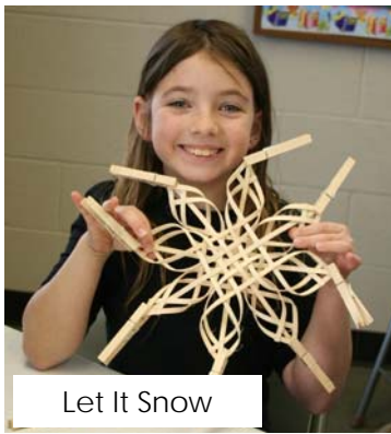
Let It Snow