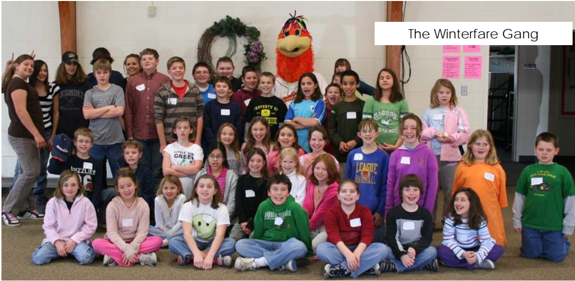
The Winterfare Gang

To see more pictures visit the photo gallery on our website http://wicomico.umd.edu/4-H