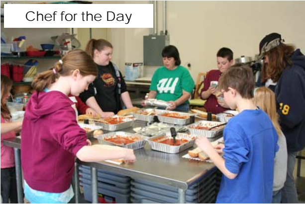
Chef for the Day