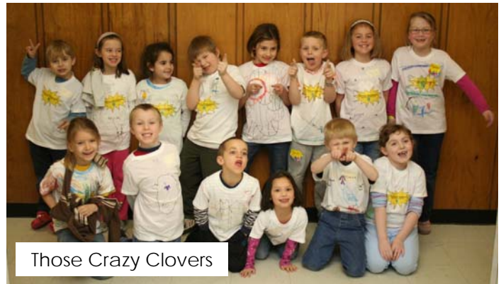
Those Crazy Clovers